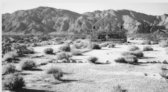
Altar remaining at the site of Camp Iron Mountain, San Bernardino County, CA.