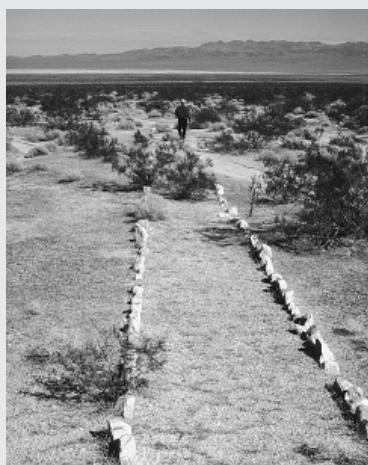
Example of rock-lined walkways remaining at the site of Camp Granite, Riverside County, California.

Presently, the majority of the Center is managed by the California Desert District of the Bureau of Land Management. Several initiatives are underway to preserve and interpret this extensive landscape. The BLM and Statistical Research, Inc., are cooperating to study, document, preserve, and interpret historic resources associated with the complex, including a recently completed historic context study to evaluate resources and plan for their management. The BLM is actively pursuing other partnerships with institutions to conduct research and promote cultural tourism opportunities.