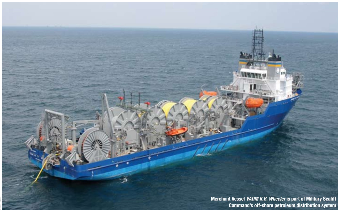
Merchant Vessel VADM K.R. Wheeler is part of Military Sealift Command's off-shore petroleum distribution system