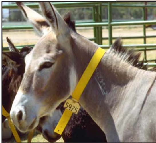
Work with your vet or animal care specialist to develop a balanced diet.

A horse's digestive system is designed for small, frequent meals. Divide your animal's feed into at least two, preferably three, meals daily (morning, noon and evening). It is important to feed on a regular schedule. It is common to feed a third of the grain at each feeding. Half or more of the hay is usually fed in the evening, with the remainder divided between the other two feedings. If hay is fed only twice daily, feed about two thirds in the evening.