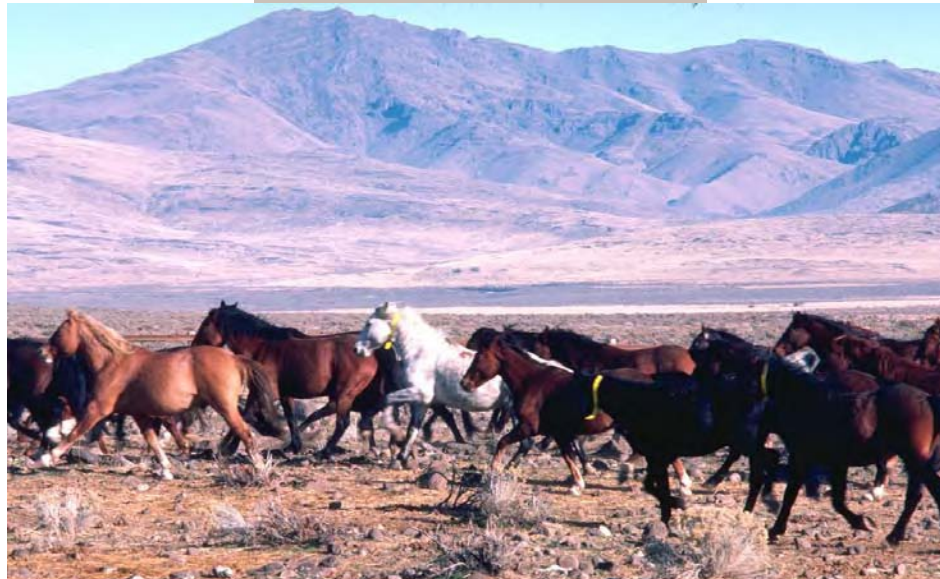
A short time ago, your animal lived in the wild and was rounded-up from the rangelands

Proper horse and burro nutrition is a complex subject. Contact your veterinarian or cooperative extension agent specializing in the care and feeding of large animals to discuss a