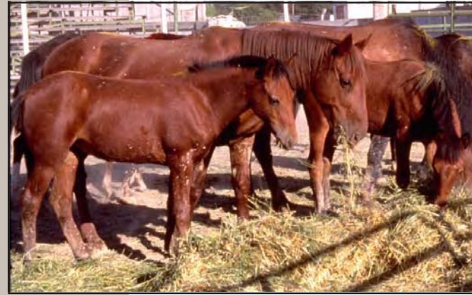
Provide food and water immediately in containers with no sharp edges

You must transport your wild horse or burro in a stock truck or trailer that meets BLM specifications. BLM prefers stock trailers over two-horse trailers. It's best to check with the BLM office hosting your adoption event for any specific trailer requirements. You will need to provide a halter and lead rope so the BLM