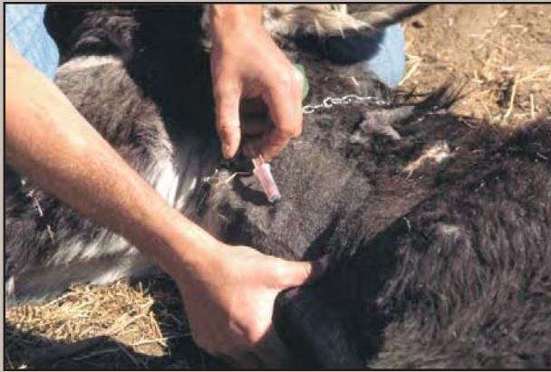
You will receive a complete set of health care records for your animal

When you adopt, you will receive a complete set of health care records for your wild horse or burro. It shows vaccinations, treatments and blood test results.