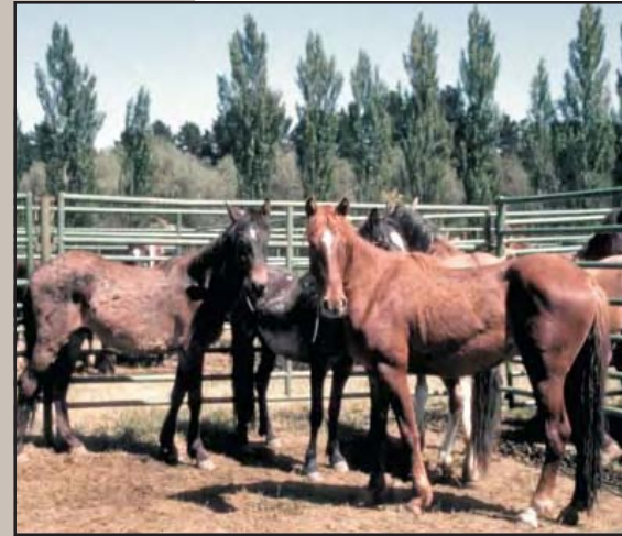
Use extreme caution around your animal during the first few days

Safety is important long after your wild horse or burro is gentled. Follow these basic safety rules as part of your daily routine when working with your horse or burro: