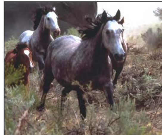
Remember - your adopted horse is wild. Work slowly and carefully.

• Keep young children and pets out of the corral. Do not let them tease or excite the animal.