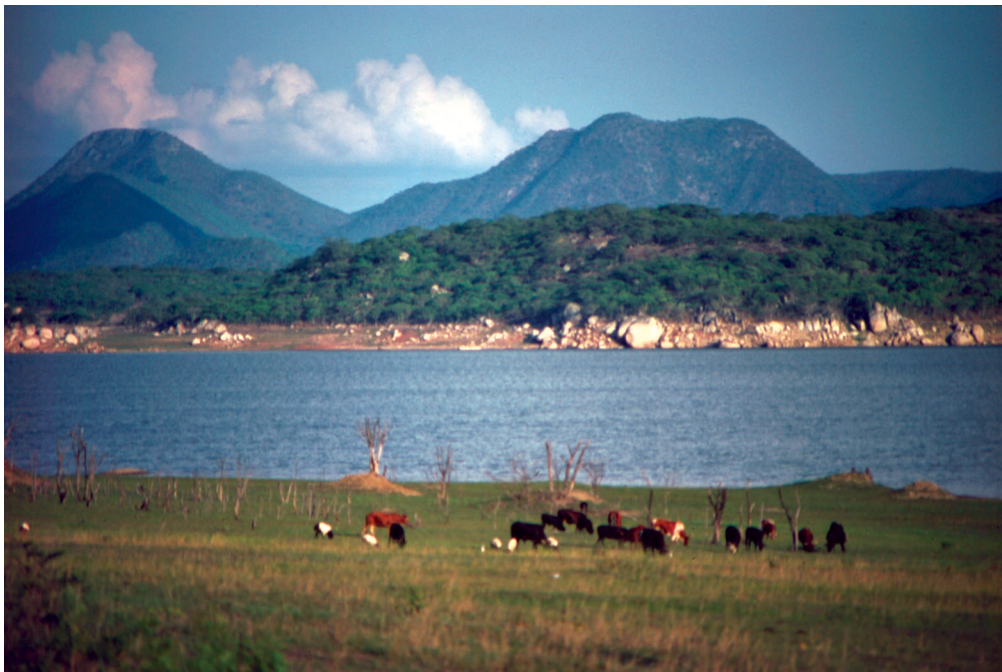
Kyle Lake.