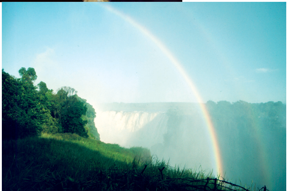
Kafue River (top); Victoria Falls, Zambezi River.