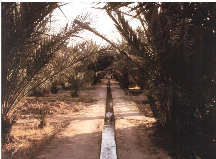
Irrigation canal, Daoura Basin.