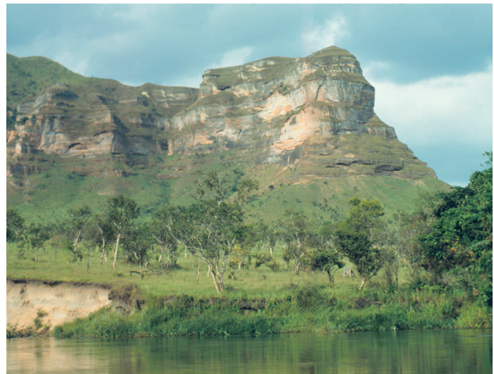
Kalambo Gorge (left). Congo/Zaire River.