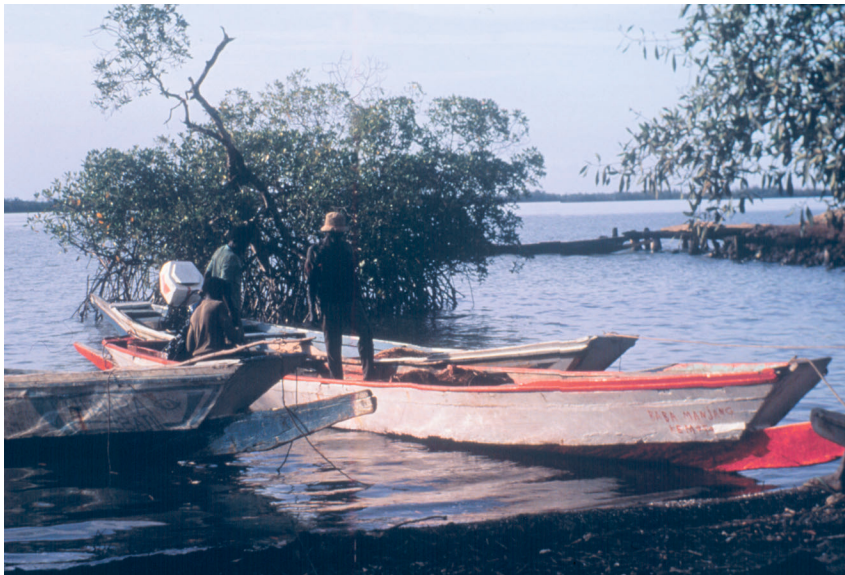
Gambia River.