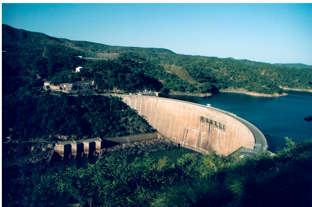
Kariba Dam, Zambezi River.