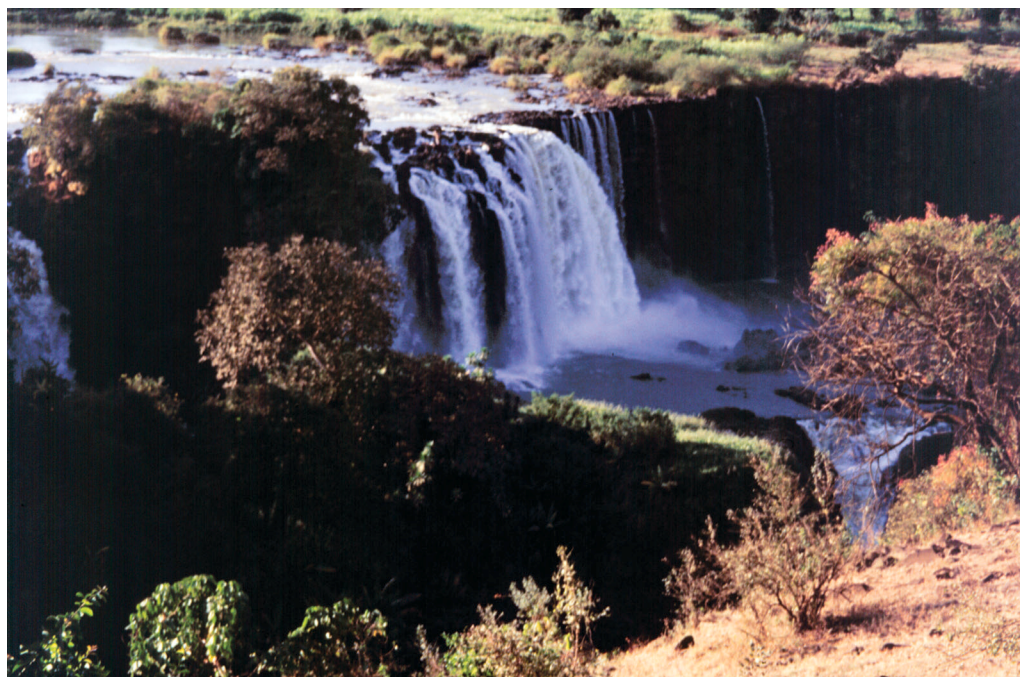
Blue Nile River.