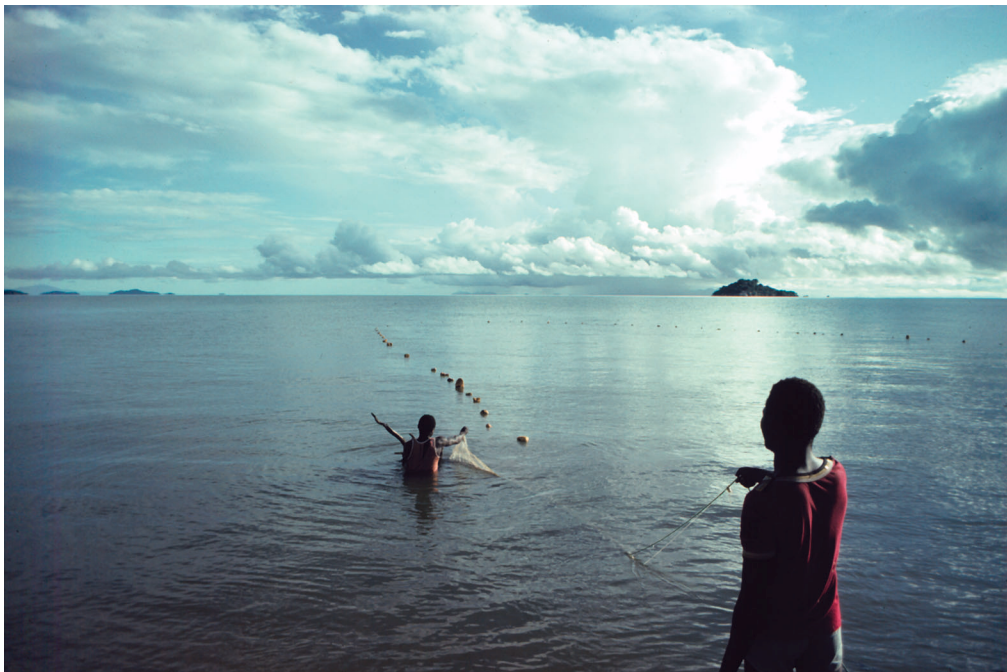
Lake Malawi.