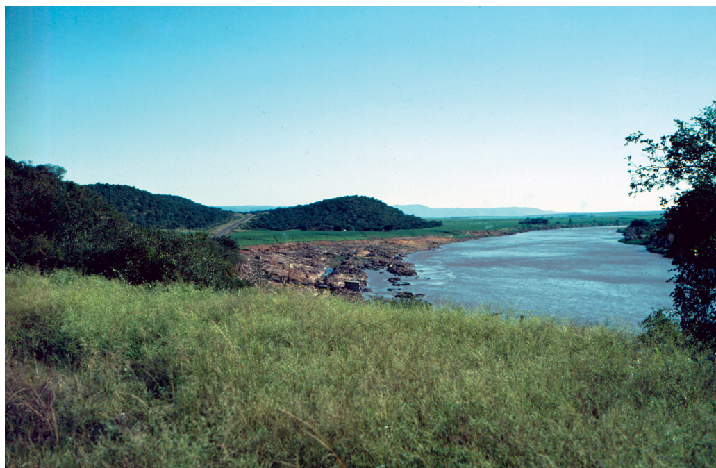
Tributary of Maputo River.