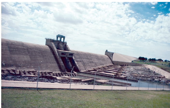
Orange River Dam.