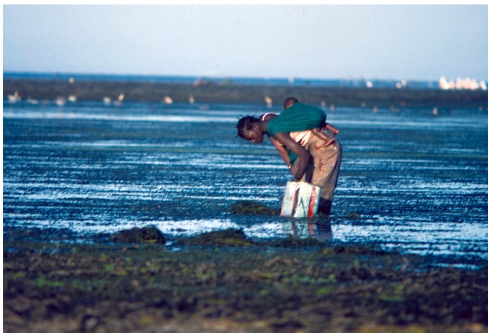
Catching fish, Kafue River.