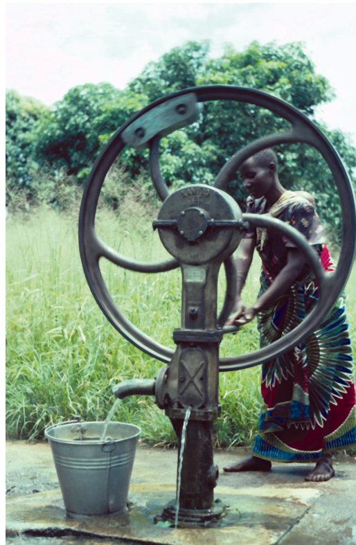
Flywheel pump, Malawi (left); tributary of Limpopo River (top right). Congo/Zaire River.