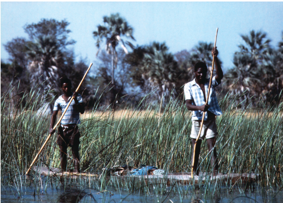
Zambezi River.

Agreement between the government of the Republic of South Africa, the government of the Kingdom of Swaziland and the government of the People's Republic of Mozambique relative to the establishment of a tripartite permanent technical committee