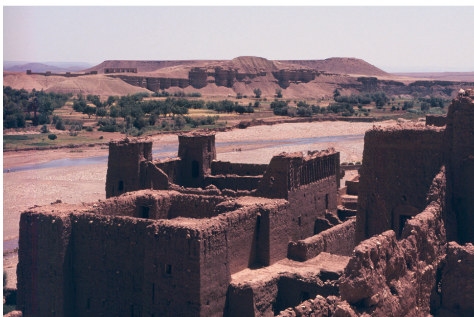
Dra River.