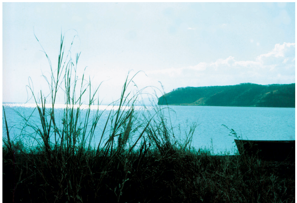
Lake Tanganyika.