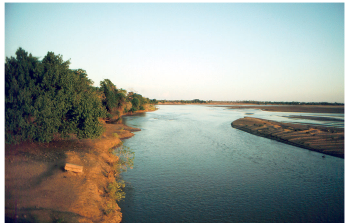
Gambia River (left). Sabi/Save River.