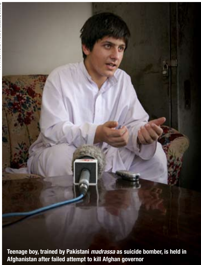
Teenage boy, trained by Pakistani madrassa as suicide bomber, is held in Afghanistan after failed attempt to kill Afghan governor