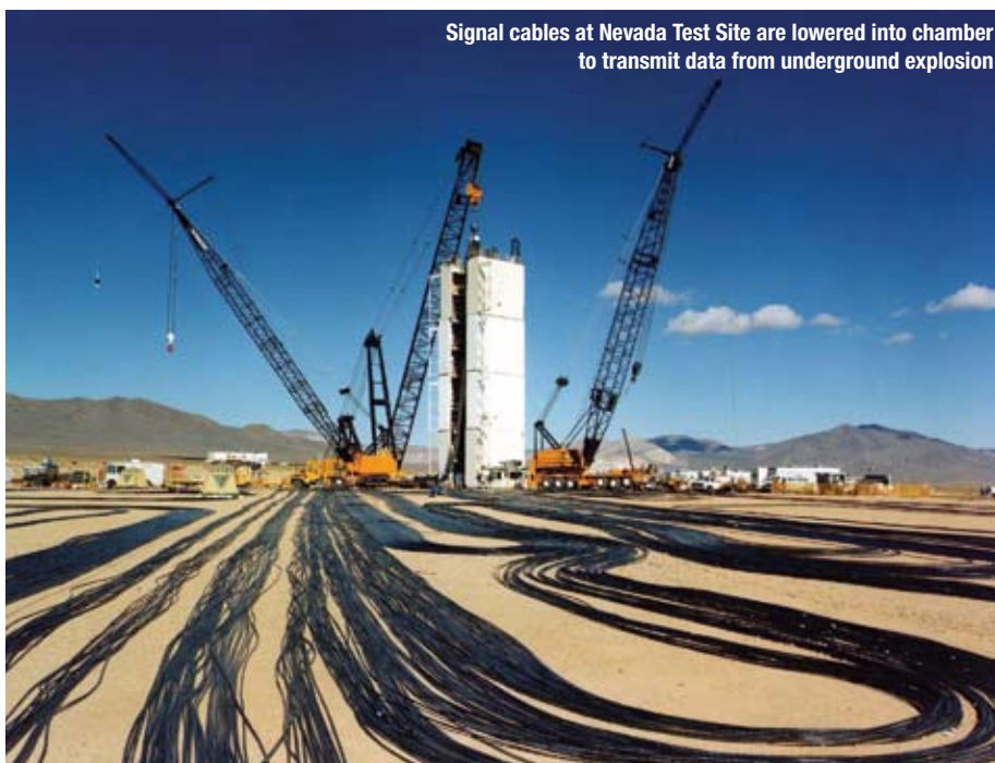
Signal cables at Nevada Test Site are lowered into chamber to transmit data from underground explosion

Two major arguments used against funding UGT readiness are that the Stockpile Stewardship Program (SSP) or Reliable Replacement Warhead (RRW) will work, which eliminates a need for UGT; and approval to test if SSP fails would never be granted anyway due to regulatory and political barriers. Both of these arguments implicitly refer to a data test that the Nuclear Test Organization focuses on most of the time. For a demonstrative detonation, they are irrelevant points. Test readiness funding based on maintaining a quick detonation capability is needed regardless of SSP or RRW success. While resistance to conducting a UGT might stop a data test, the crisis conditions that could lead to interest in a