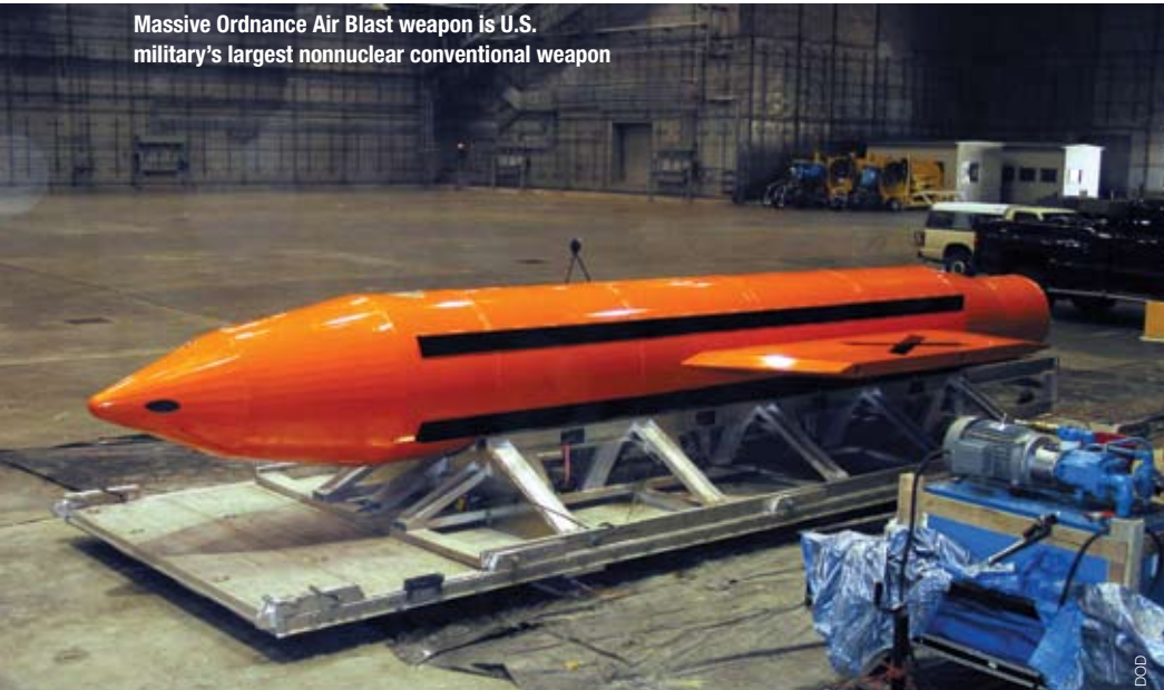
Massive Ordnance Air Blast weapon is U.S. military's largest nonnuclear conventional weapon