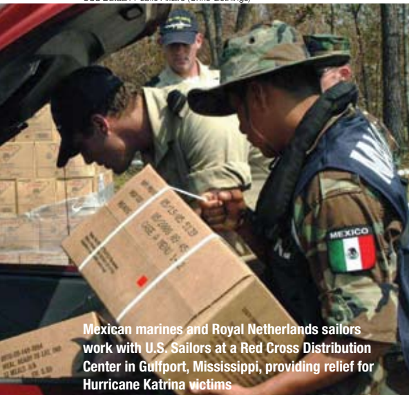
Mexican marines and Royal Netherlands sailors work with U.S. Sailors at a Red Cross Distribution Center in Gulfport, Mississippi, providing relief for Hurricane Katrina victims