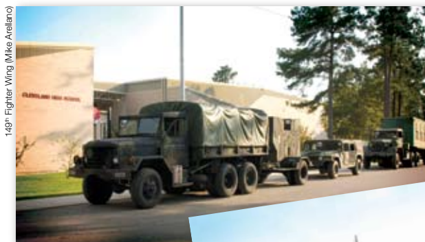
Above: Texas National Guard vehicles distribute food and water to victims of Hurricane Rita

Also representative of JIIM work is the historic precedent of September 2006, when the TXMF was designated by the Governor's Division of Emergency