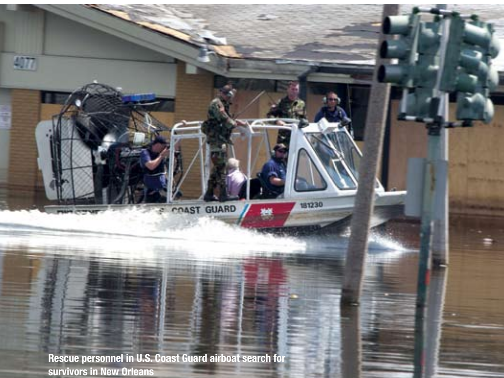
Rescue personnel in U.S. Coast Guard airboat search for survivors in New Orleans

a revision to the Insurrection Act seems to strengthen the Federal Government's power to direct the national response in certain catastrophic situations