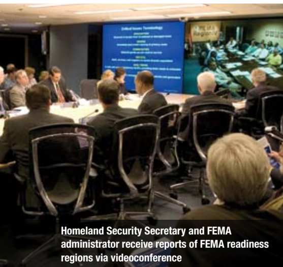
Homeland Security Secretary and FEMA administrator receive reports of FEMA readiness regions via videoconference

Open-ended Disasters. The Nation has not fully addressed catastrophic events that are open-ended. A pandemic, for example,