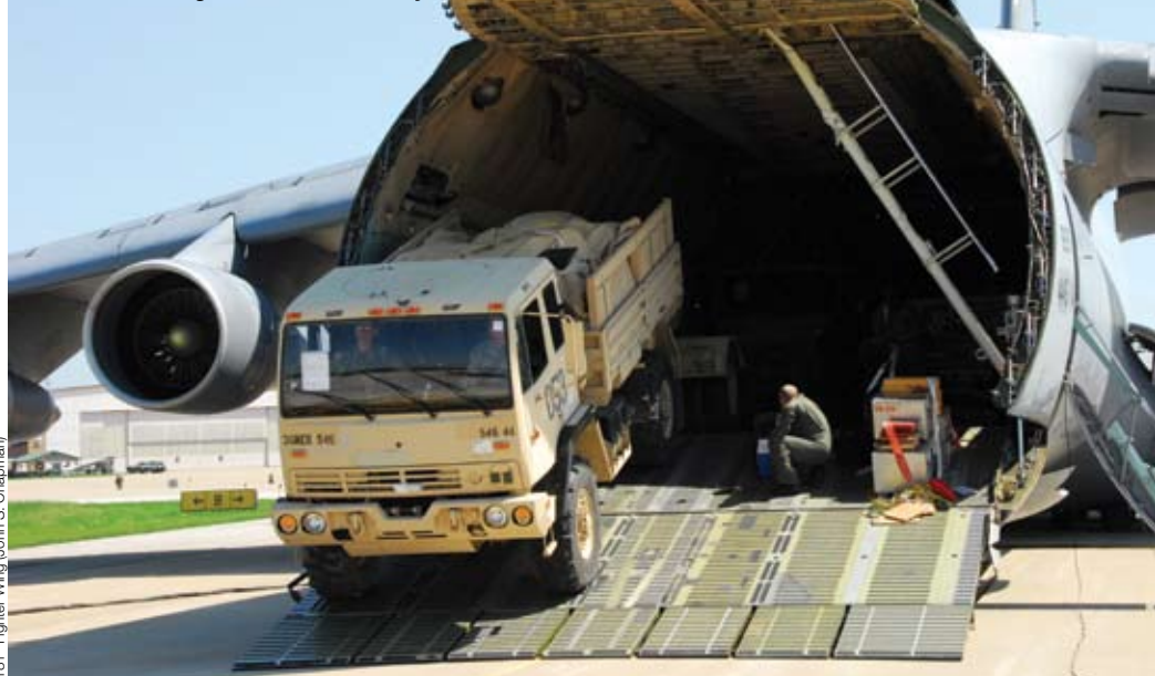
Army trucks offload from Air Force C-5 at Hulman Field during exercise Ardent Sentry