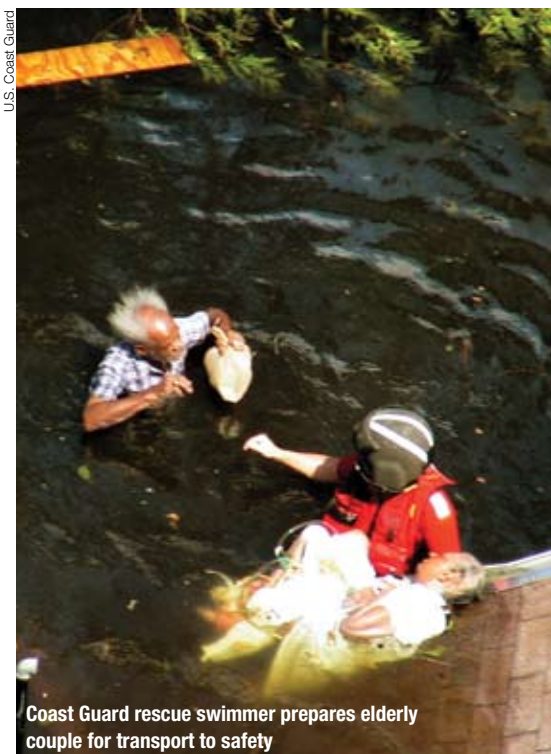
Coast Guard rescue swimmer prepares elderly couple for transport to safety

FEMA and U.S. Northern Command have established standardized flyaway communications packages for disaster response elements