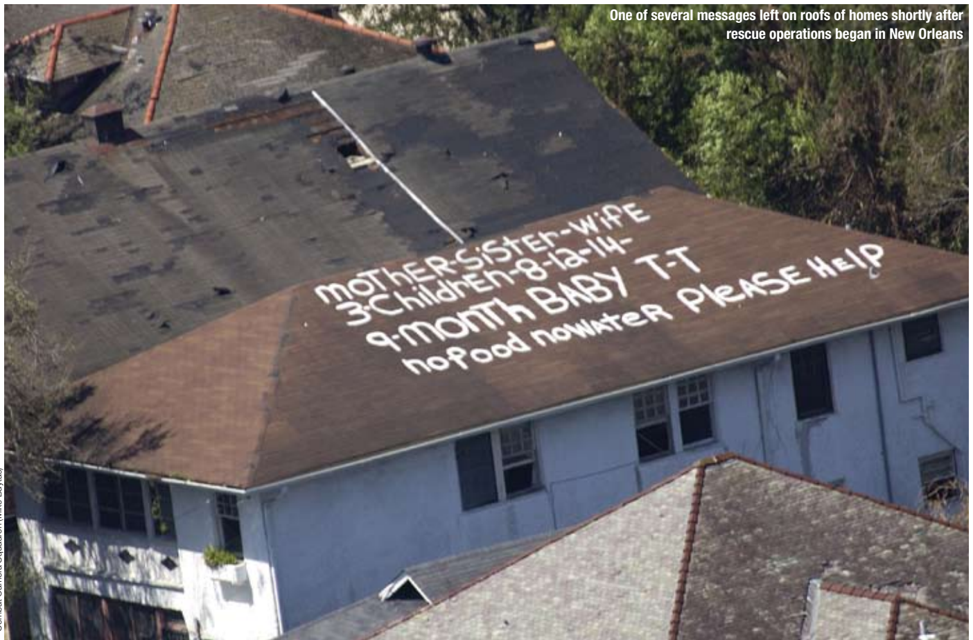
One of several messages left on roofs of homes shortly after rescue operations began in New Orleans