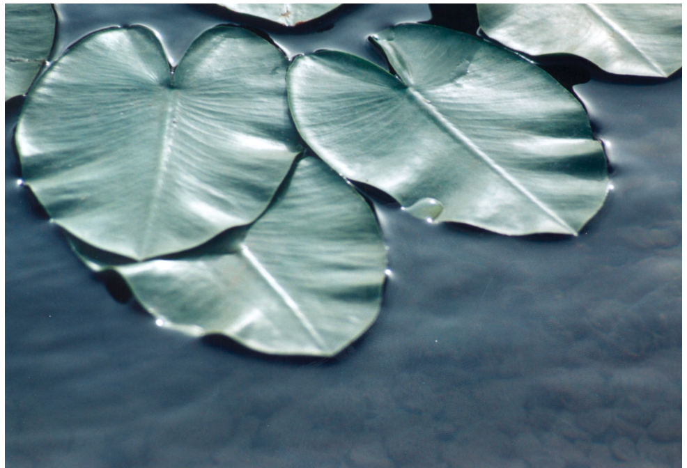
Water lilies, Tigris River tributary.