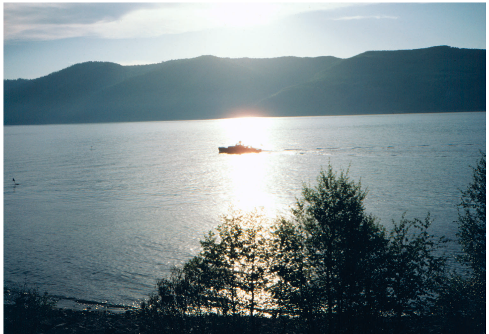
Lake Baikal.