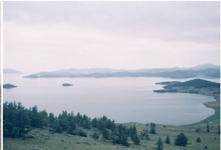
Lake Baikal.