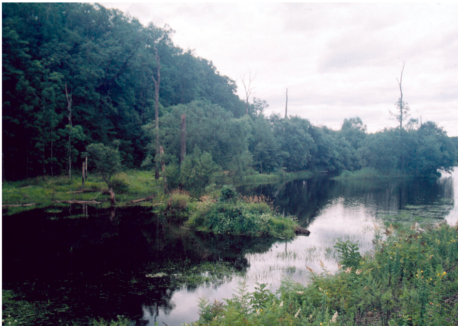
Amur River.