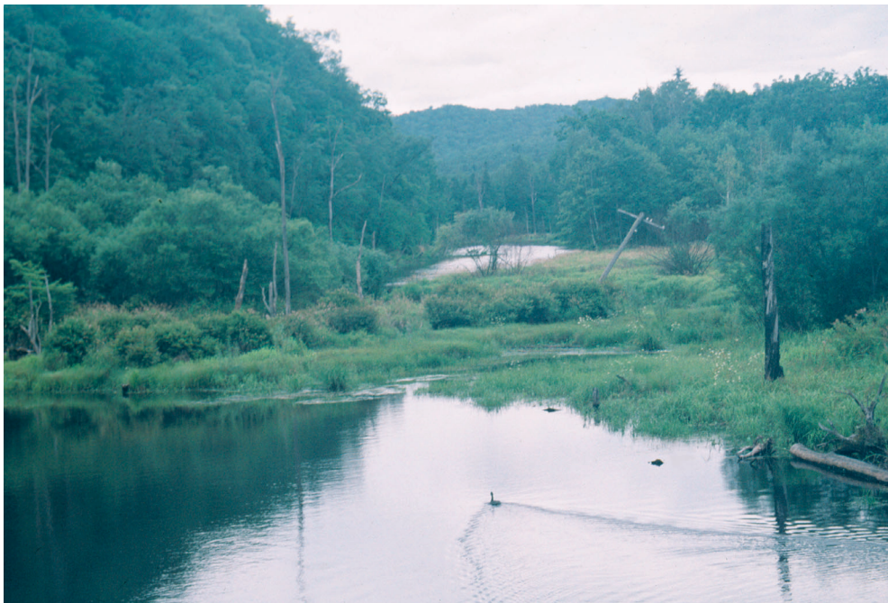
Amur tributary.