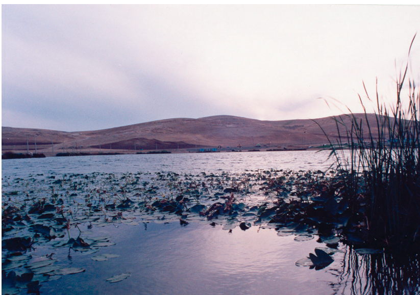
Sirwan River (left); Lake Niloofer.