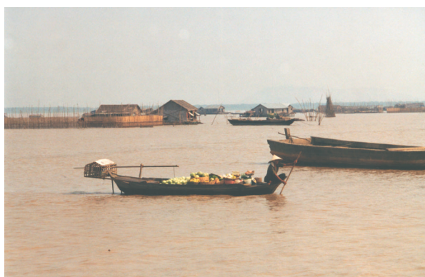
Tonle Sap.