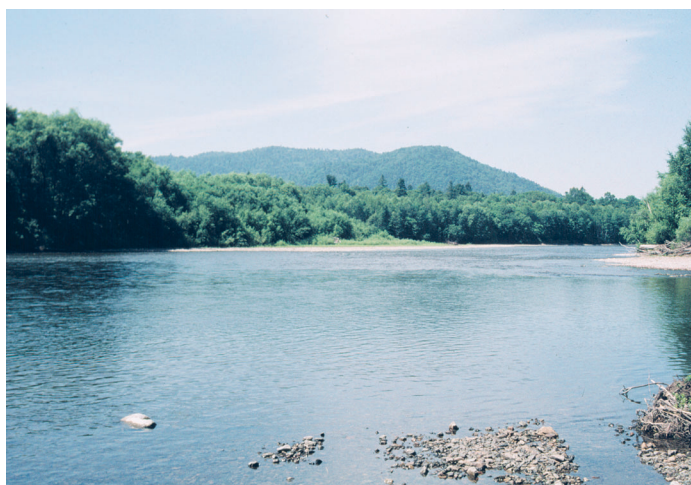
Tributary of Amur (left); Khor River.