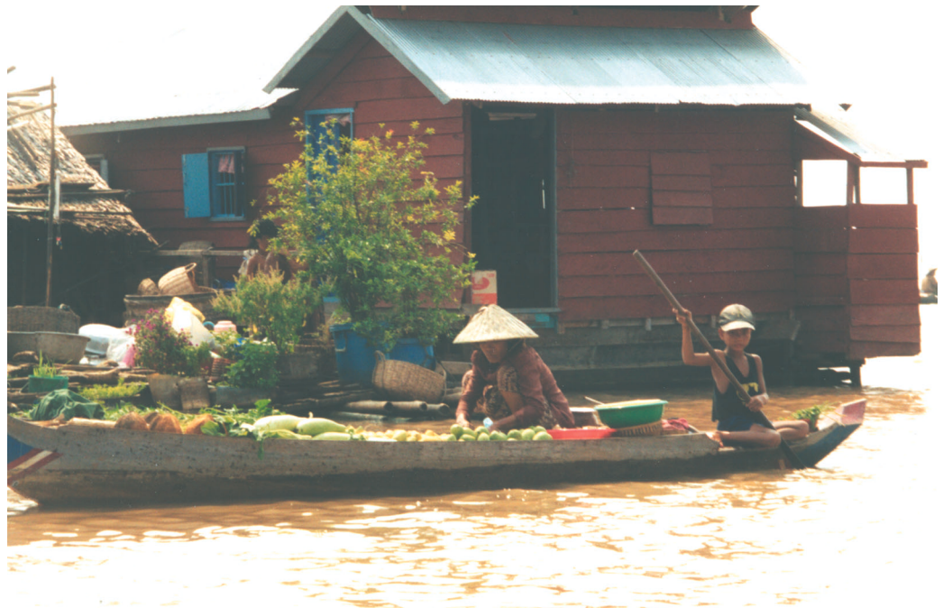
Tonle Sap.