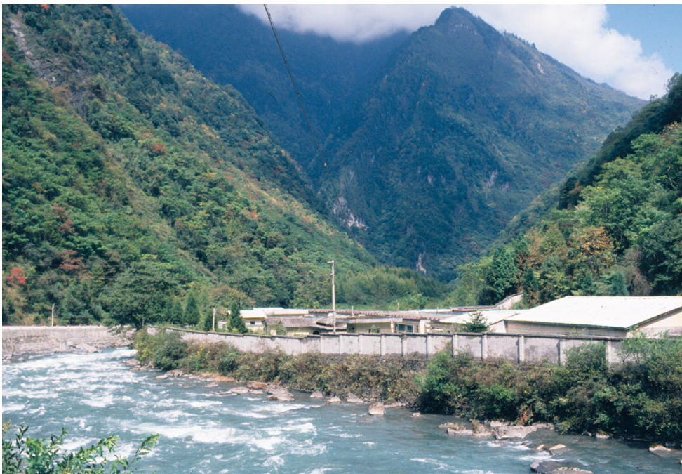
Tibetan highlands tributary.