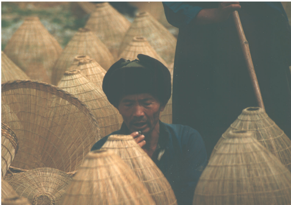
Er Lake, fish traps.