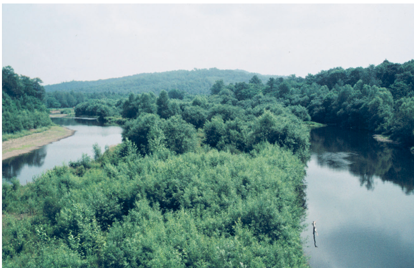
Amur River.