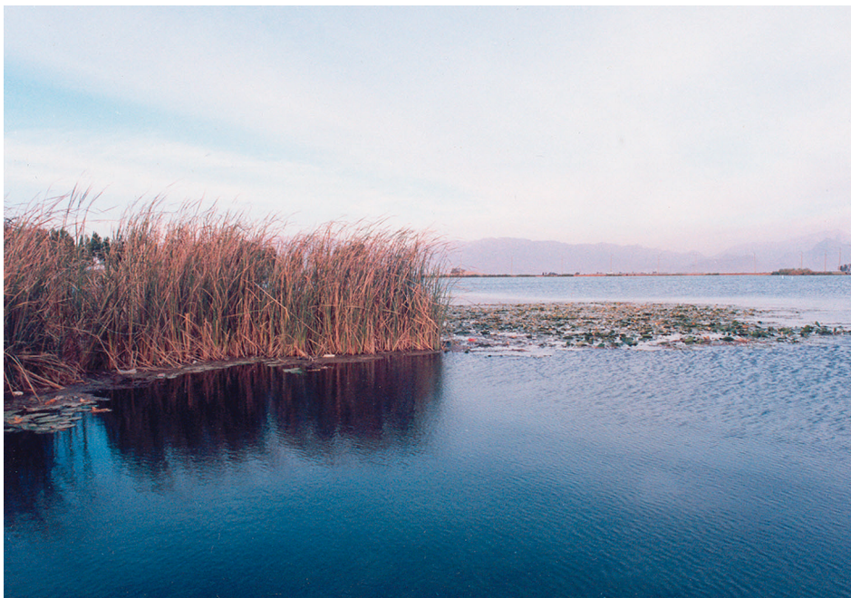
Lake Niloofar.