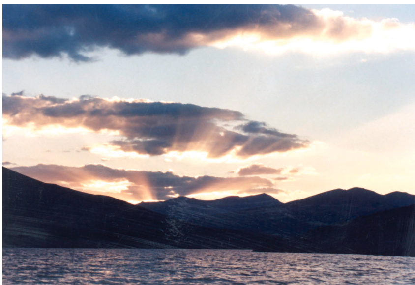
Tigris tributary (left); Mahabad River.