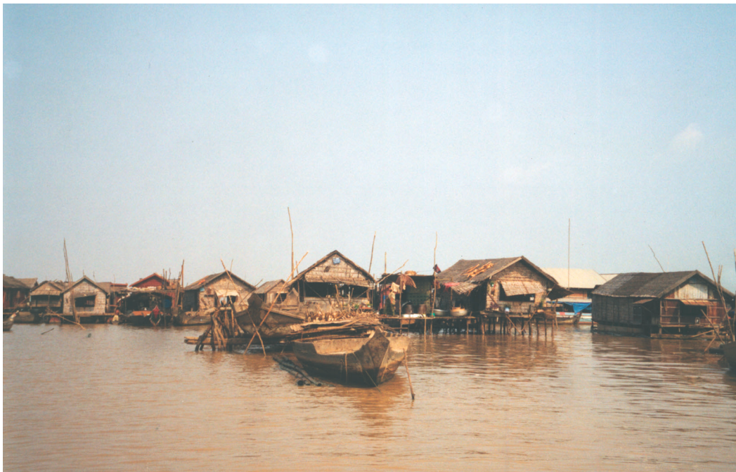
Tonle Sap.

Agreement between the government of Australia (acting on its own behalf and on behalf of the government of Papua New Guinea) and the government of Indonesia concerning administrative arrangements as to the border between Papua New Guinea and Indonesia