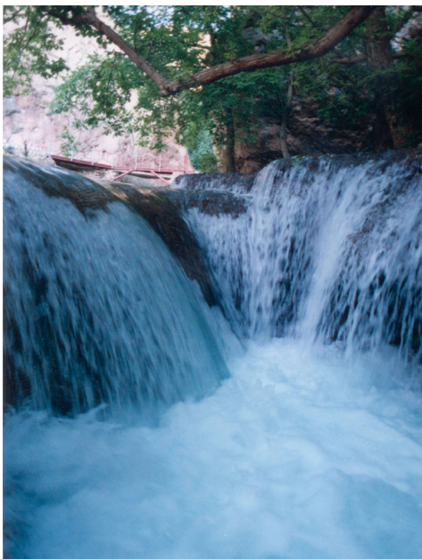
Simareh River (left). Amur River.