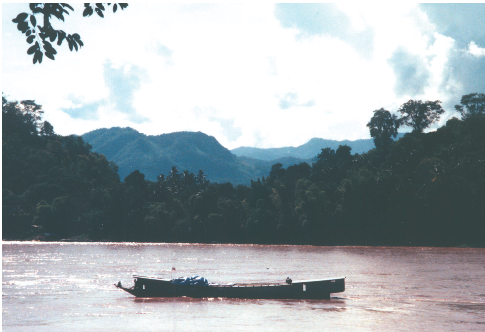
Mekong River.