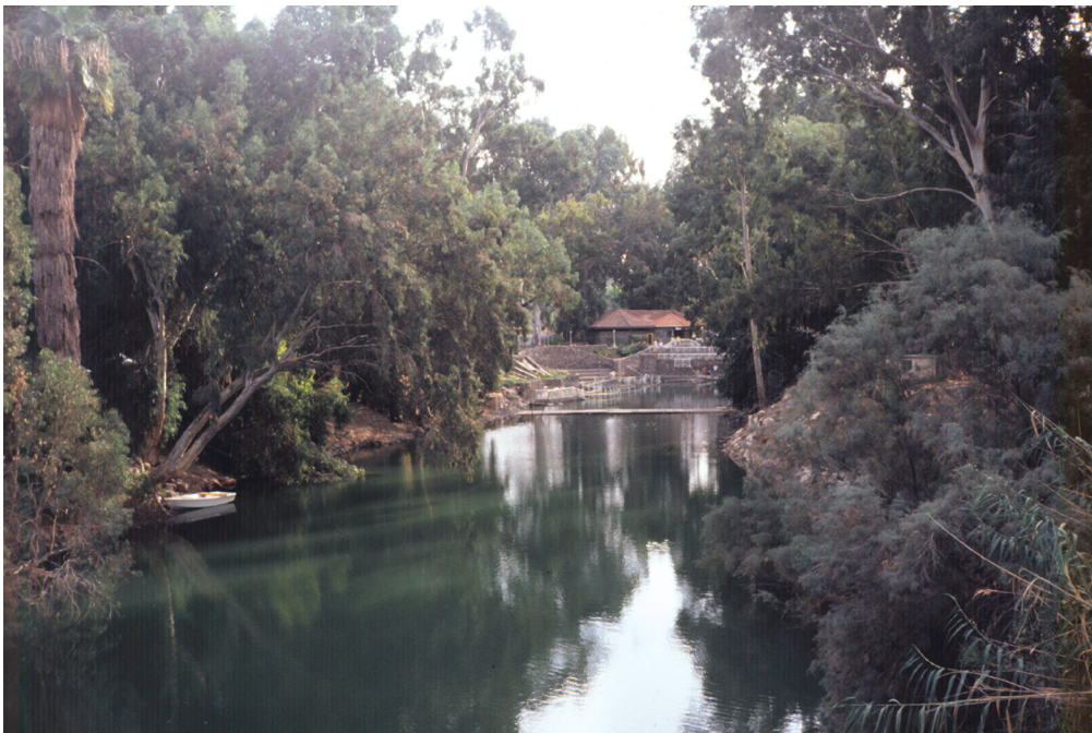
Jordan River.