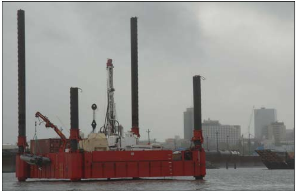
A jack-up barge shipped to Alaska rests in Cook Inlet north of the Port of Anchorage in September 2007. The barge enabled geotechnical engineers to collect soil samples on a stable platform to prepare for dredging for the port's future expansion. Tidal fluctuations in the inlet can approach 38 feet.

Natural attenuation is another option. After looking at the risk, nothing may be done if there is minimal impact in