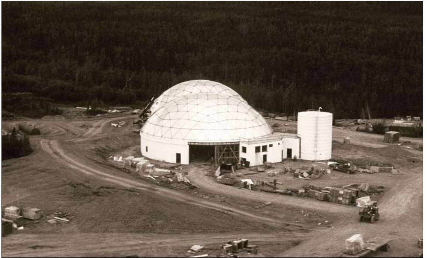
U.S. Army Corps of Engineers file photo