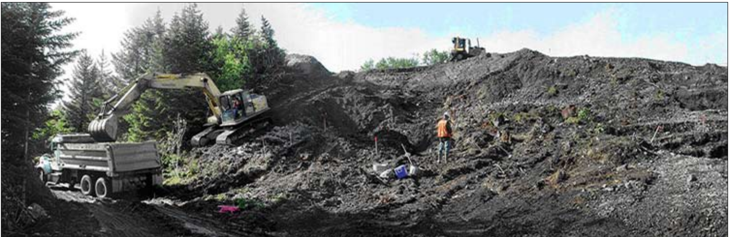
The Cape Chiniak Tracking Station on Kodiak Island, which was contaminated with PCBs and petroleum products is shown above during remediation and below after the site was restored.

In the past decade, the program has received several national-level awards. The Annette Island Project Delivery Team received the Secretary of the Army Environmental Award for environmental restoration, and the Fort Tidball FUDS team won the Secretary of the Army Environmental Award for cultural resources management. The Buskin Beach Tar in Freshwater Area FUDS team received a National Pollution Prevention Roundtable Most Valuable Pollution Prevention Award.