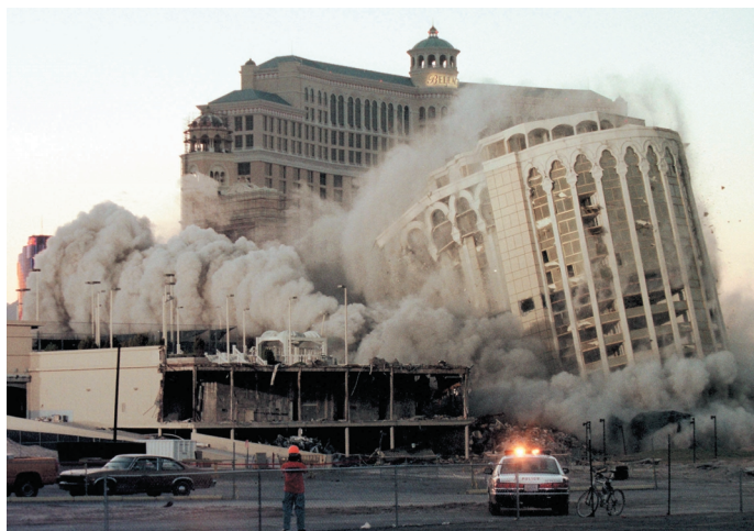
Demolition by implosion of the Aladdin Hotel, Las Vegas, Nevada, April 27, 1998.

Asphalt paving materials are recovered from demolished roads. These are valuable, both for the asphalt binder and for the aggregates. More than 100 million t of worn-out asphalt pavement are recovered annually. About 80 percent of the recovered material is currently