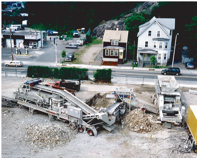
Portable, closed-circuit crushing and screening operation, designed specifically for on-site processing of concrete, courtesy of Cedarapids, Inc., Cedar Rapids, Iowa.

usage rates in lower valued products, is related to quality issues, both real and perceived. State agencies have been slow to accept recycled aggregates from concrete for high-quality uses such as road surfacing. Specifications, based on considerable research and favorable in-service experience, have allowed its use mostly as road base material.