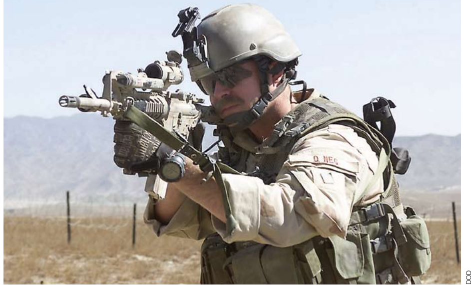
Special Forces Soldier providing security in Afghanistan near Pakistan border

destruction (or mass effect) that poses the greatest strategic threat and must remain our highest priority.