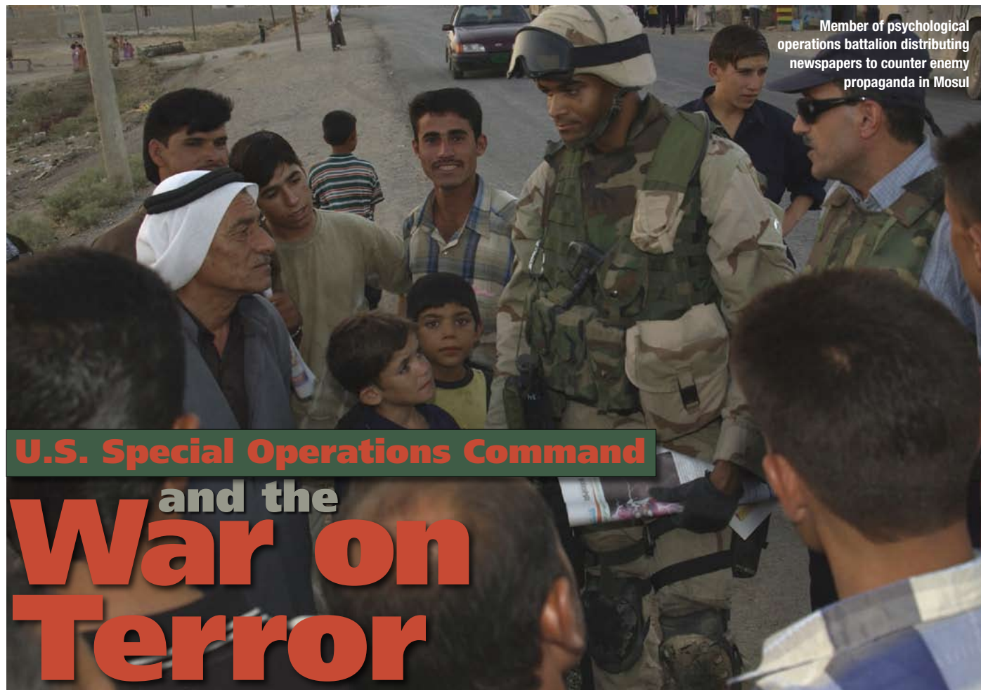
Member of psychological operations battalion distributing newspapers to counter enemy propaganda in Mosul