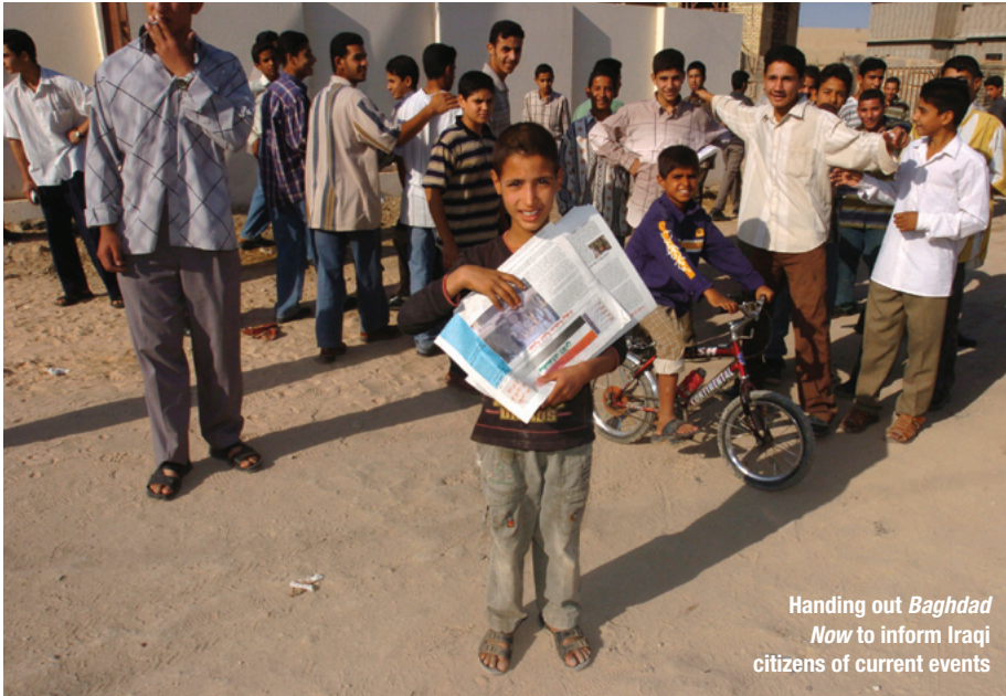
Handing out Baghdad Now to inform Iraqi citizens of current events