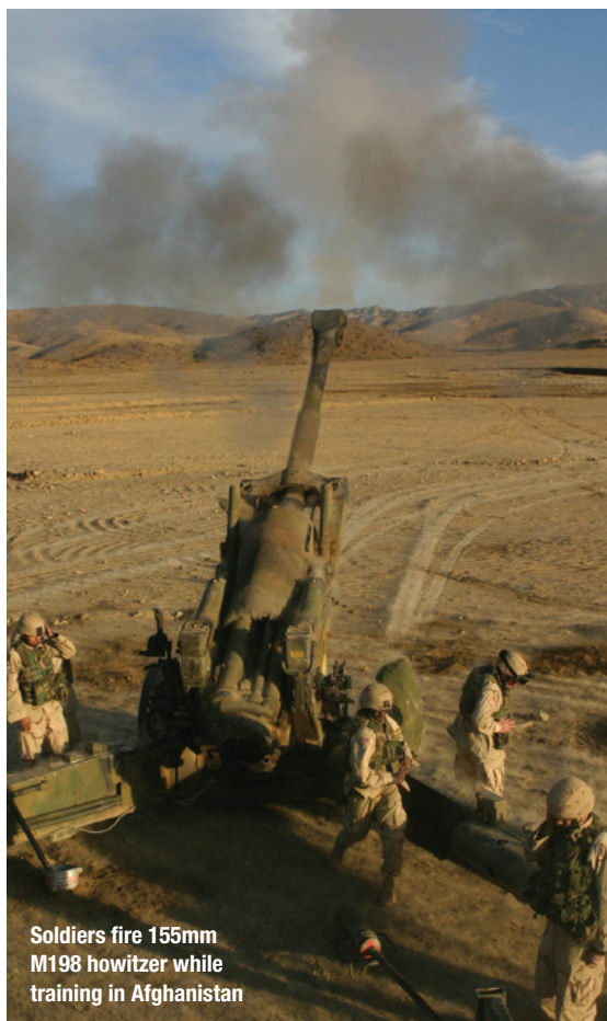
Soldiers fire 155mm M198 howitzer while training in Afghanistan