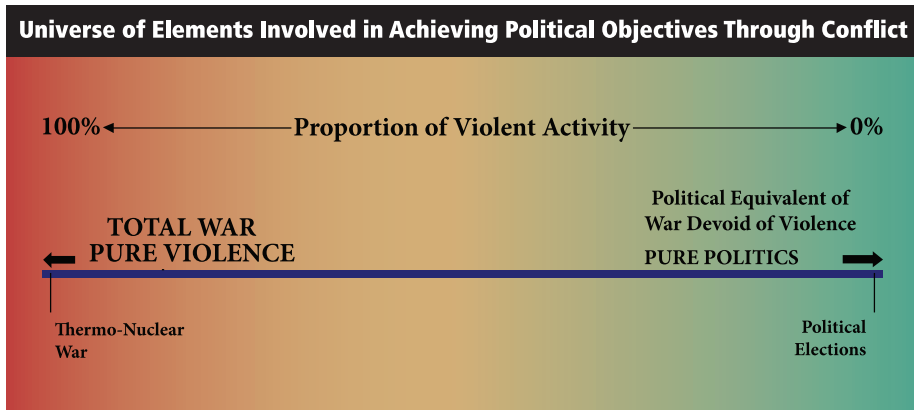
Figure 2: The Universe of Political Conflict

What would be the role of IO in such a conflict? At the extreme end of the spectrum, information operations—if they existed at all—might include activities associated with computer attack, signals intelligence, deception, or PSYOP measures. However, there would be little concern for cultivating through political rhetoric (PSYOP or public diplomacy) some grounds for hope of political reconciliation or postconflict cooperation, as the political objective would be total destruction of the enemy—a war of annihilation (see figure 2).