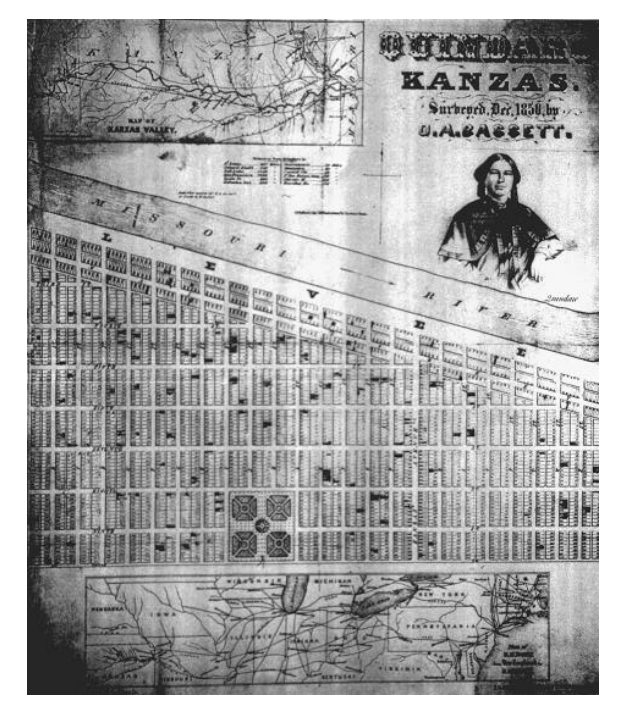
Plat of Quindaro, Kansas by O. A. Bassett, December, 1856.

During the 1990s, groups of students and faculty from area colleges and universities have visited the Quindaro ruins at the northern terminus of 27th Street in Kansas City, Kansas, with the