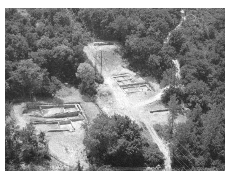
Aerial view of the partially excavated ruins in the center of Quindaro, 1987.

Library, Providence, RI; Beneke Library, Yale University) and archives and museums that carry records of the 19th-century settlement companies and trans-Missouri shippers. In other words, the best way to augment our knowledge of Quindaro is to pursue local oral histories with great vigor and to systematically search the major repositories that contain important records and documents describing towns on the western frontier.