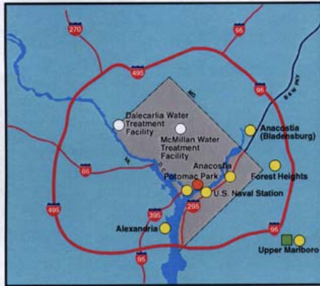
INSERT Washington, D.C. and Vicinity