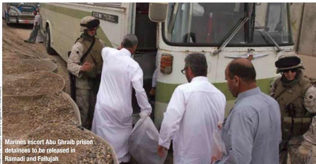
Marines escort Abu Ghraib prison detainees to be released in Ramadi and Fallujah

The importance of having experts available to run internment facilities and conduct interrogation cannot be overstated. In Algeria in the 1950s, it was noted that putting responsibility for internment and interrogation in the hands of tactical commanders led to hugely mixed results. In some areas, torture became standard operating procedure. In others, units