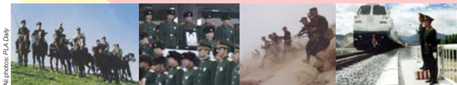
Left to right: Xinjiang Production and Construction Corporation members on patrol; PLA memorial service for policeman killed in raid on terrorist camp in Xinjiang; People's Armed Police train in Xinjiang; People's Armed Police guard train station in Xinjiang

The counterinsurgency in Xinjiang was enabled by seemingly infinite political will: the Chinese people demand internal stability and give the regime freedom of action to remove threats from the periphery. The Communist Party, concerned primarily with self-preservation of its position atop the one-party-state, drives and assists state responses