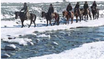
Kunjerab Front Defense Company patrols high country