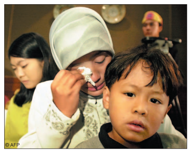
An Indonesian Muslim woman grieves at a family gathering for victims of the J.W. Marriott Hotel bombing while holding her nephew, whose father was killed in the attack on 5 August 2003.