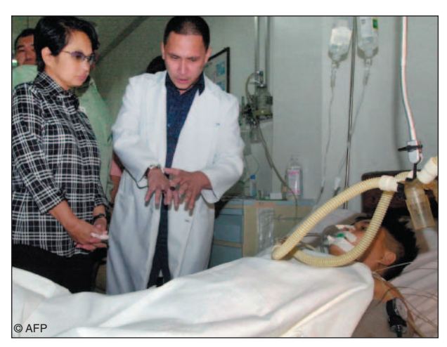
Philippine President Gloria Macapagal-Arroyo visits a patient at Davao Medical Center on 5 March 2003, the day after he was injured in a bomb blast at the local airport.

The Philippines faces threats from internal terrorism on several fronts. The United States, for example, has listed four indigenous groups as Foreign Terrorist Organizations—the Abu Sayyaf Group (ASG), the Communist Party of the Philippines/New People's Army, Alex Boncayo Brigade, and the Pentagon Gang.