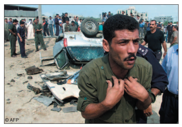
A Palestinian policeman gestures at the scene of a roadside bomb attack on a convoy carrying US officials near the Erez border crossing leading into southern Israel on 15 October 2003. Three Americans were killed

The PA's efforts to thwart terrorist operations were minimal in 2003. The PA security services remained fragmented and ineffective. The services were also hobbled by corruption, infighting, and