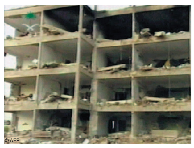
Saudi Arabian television broadcast footage of this remnant of an expatriate compound near Riyadh after a suicide bomb attack, 12 May 2003.

The attacks also led Riyadh to implement a variety of programs aimed at directly combating terrorist activity. In early May 2003, the Saudis began to publicize their counterterrorist efforts, including naming 19 individuals most wanted by the security services for involvement in terrorist activities. In early December, Riyadh announced the names of 26 individuals—including the seven remaining fugitives from the list of 19—wanted for terrorist-related activities and provided background information on the suspects to help the public to identify them. Soon thereafter, Saudi security forces killed operative Ibrahim bin Muhammad