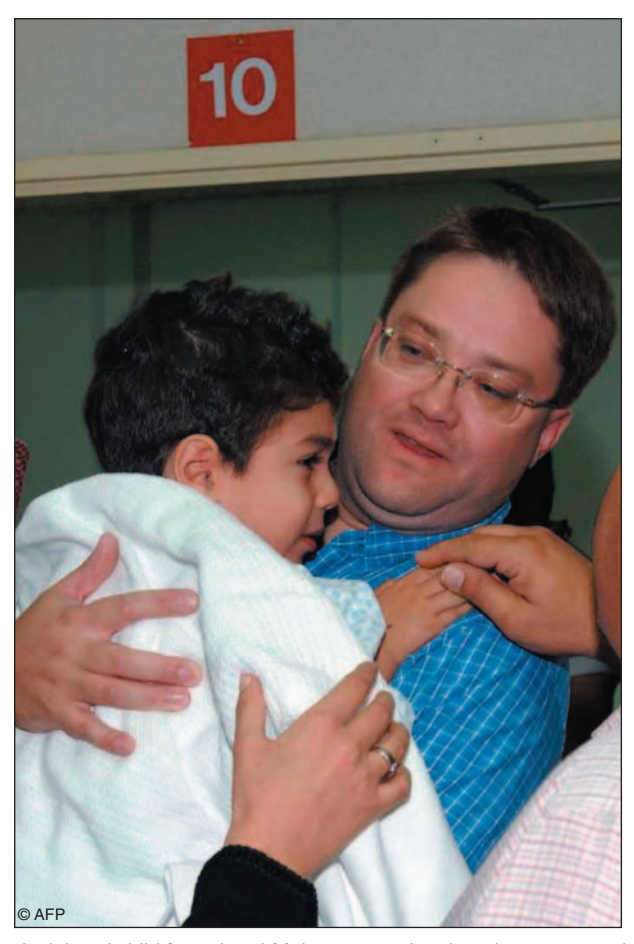
An injured child from the al-Muhaya expatriate housing compound near Riyadh, Saudi Arabia, is comforted by family members following a bombing on 9 November 2003, when a stolen police jeep laden with explosives penetrated the fortified compound.

Saudi Arabia has signed nine of the 12 international conventions and protocols relating to terrorism and is a party to six.