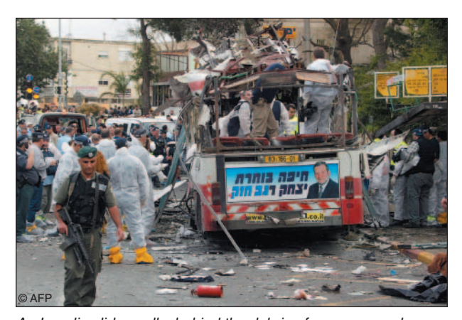
An Israeli solider walks behind the debris of a passenger bus after a Palestinian suicide bomber attacked it in the northern Israeli town of Haifa, 5 March 2003.

poor leadership. There are indications that some personnel in the security services, including several senior officers, have continued to assist terrorist operations.