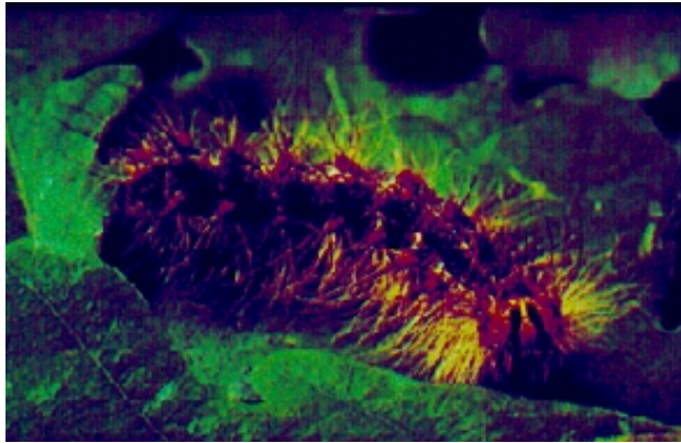
Gypsy moths defoliate trees and shrubs. Further introductions of this pest could cause widespread damage to plants on both private and commercial land in the United States. APHIS file photos show a gypsy moth caterpillar and an adult male (top right) and female with egg mass (lower right).