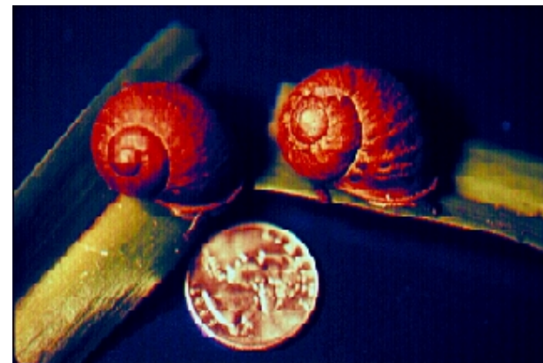
The giant African snail (top), white garden snail (middle), and brown garden snail (bottom) are destructive pests that can be found on outdoor household goods.