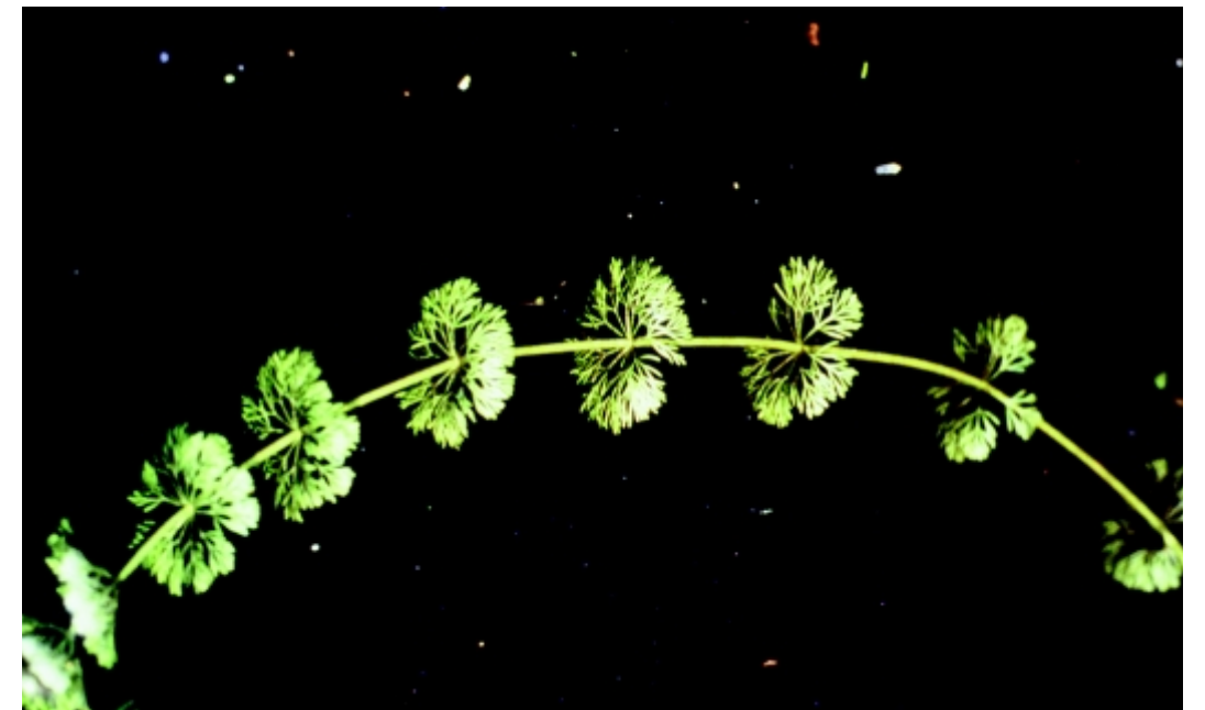
Limnophila Limnophila sessiliflora