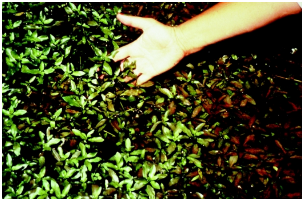
Indian hygrophila Hygrophila polysperma