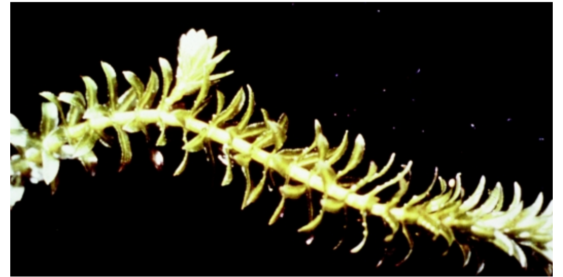
Hydrilla Hydrilla verticillata