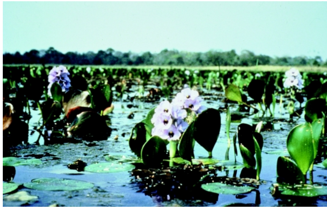
Anchored waterhyacinth Eichhornia azurea