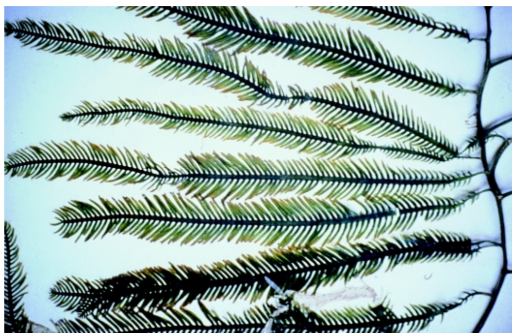
Caulerpa Caulerpa taxifolia