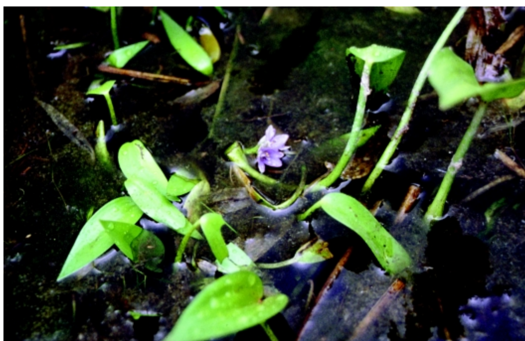
Monochoria Monochoria vaginalis