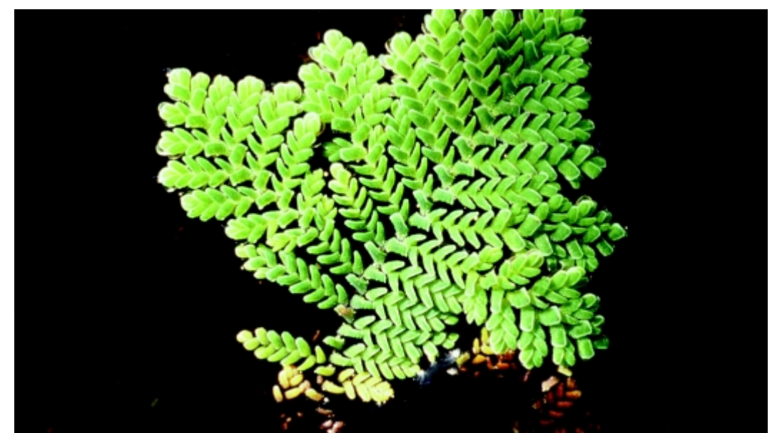
Pinnate mosquitofern Azolla pinnata