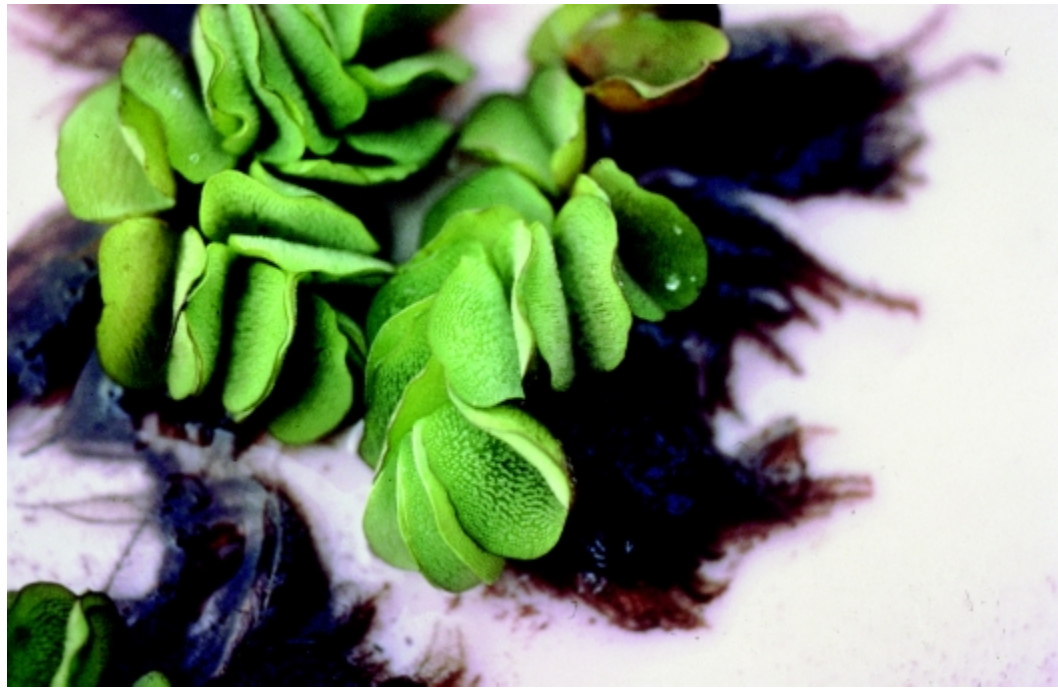
Giant salvinia Salvinia auriculata complex

For more information on the Federal Noxious Weeds List, including more aquatics, visit www.aphis.usda.gov/ppq/weeds/weedhome.html on the World Wide Web.