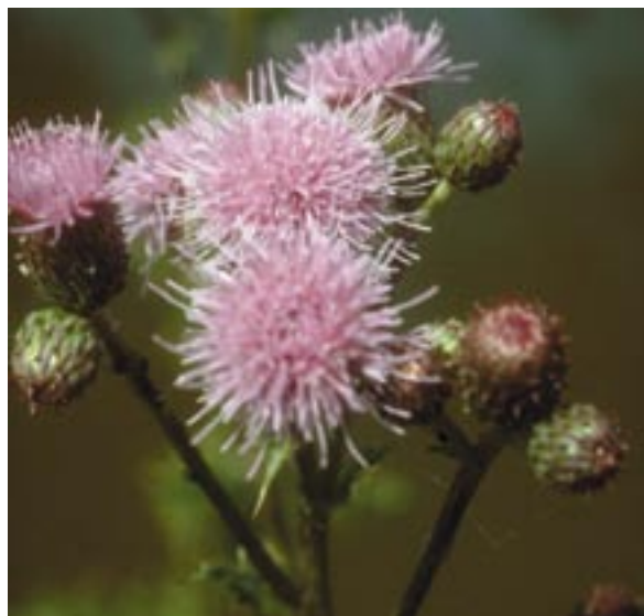
At the National Weed Science Laboratory in Fort Collins, CO, CPHST scientists develop methods to control exotic invasive weeds such as Canada thistle.

NWML and the Albany Plant Protection Station (Albany, CA) are leaders in developing methodologies and technologies to control invasive weeds. NWML researches the chemical and biological control of invasive weeds such as toadflax and leafy spurge. Additionally, the Albany Plant Protection Station is developing artificial diets to mass-produce natural enemies used in biocontrol of noxious weeds.