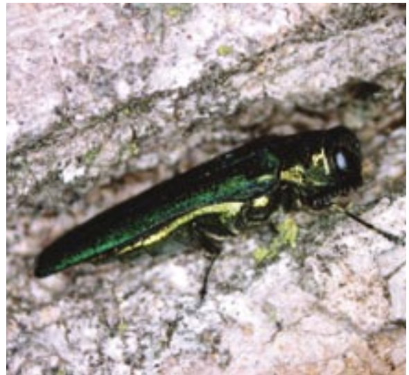
CPHST's Pest Survey Detection and Exclusion Laboratory at Otis, MA, develops methods for controlling and eradicating forest pests, such as the emerald ash borer.

ANPCL provides expertise in analytical chemistry to support PPQ programs to eradicate or control invasive species with chemical treatments. Additionally, the lab synthesizes pheromones and insect attractants needed by other CPHST laboratories to develop trapping technologies for invasive species. ANPCL personnel are also involved in developing methods of detection, regulation, and control of soil-inhabiting pests, particularly the imported fire ant.