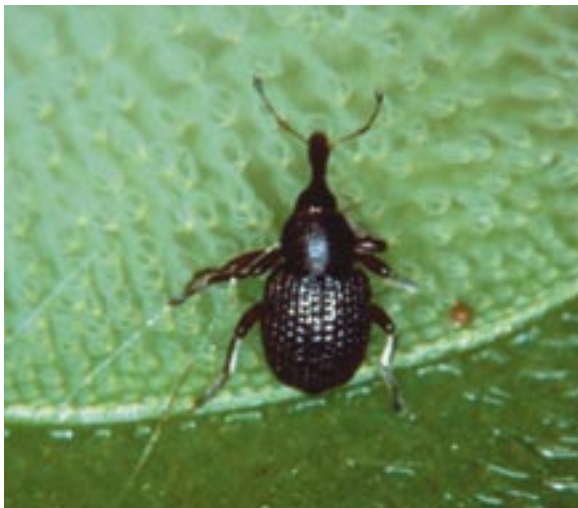
The Pest Detection, Diagnostics, and Management Laboratory in Edinburg, TX, develops technologies to mass-rear biological control agents, such as the giant salvinia weevil.

The primary mission of PDDML is to identify and develop technologies to control agricultural and environmental pests. Projects include mass-producing and releasing biocontrol agents and providing geographic information system (GIS) support for various emergency programs. For the Caribbean offshore initiative, PDDML assesses pest threats to the United States and provides methods to assist survey, identification, and management.