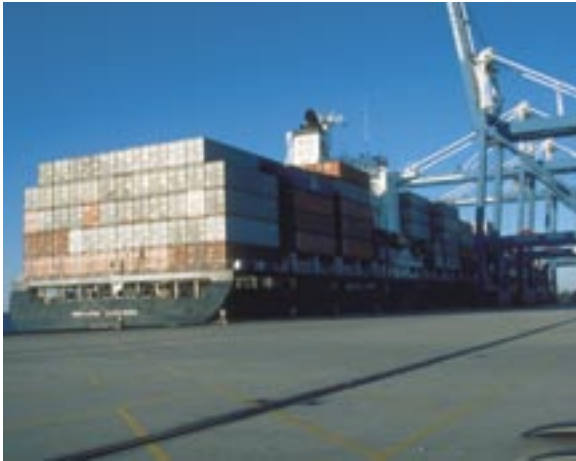
The Treatment Quality Assurance Unit in Raleigh, NC, develops methods and protocols for treating commodities so they are safe to enter the United States.

TQAU provides scientific support for Quarantine Policy Analysis and Support, enhances responsiveness to APHIS emergency programs, supports the PPQ Treatment Manual, and increases CPHST's ability to respond to port technology needs. Additionally, the unit provides treatment support, as well as facility, vessel, and container certification, onsite training, and site assistance.