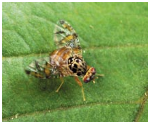
The Fruit Fly Genetics and Rearing Laboratory in Waimanalo, HI, works to improve methods of mass-rearing sterile insects for use in several control programs. This photo shows a sterilized Mediterranean fruit fly.

FFGML and its stations in Gainesville, FL, and Guatemala City, Guatemala, work to improve the standards and quality of the mass-production of fruit flies. Projects include improving the mating competitiveness of mass-reared flies, stabilizing the production of the temperature-sensitive lethal genetic sexing strain of the Mediterranean fruit fly, and developing novel genetic strains to enhance control measures.