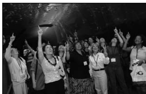
Conference attendees swim with the fishes and enjoy a "hands on" experience at the Georgia Aquarium.