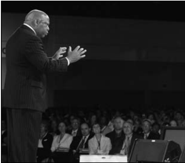
Congressman John Lewis

Entering to the pulsating beats of the Inner Harbor AmeriCorps Youth Drummers, more than 4,000 leaders of the volunteer and service movement crowded the Georgia World Congress Center yesterday for the opening plenary.