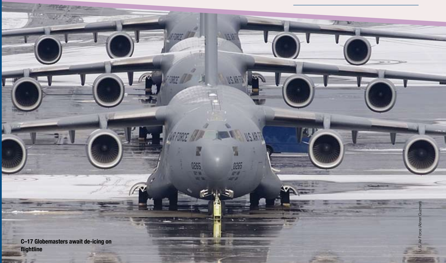
C-17 Globemasters await de-icing on flightline

Secretary Laird intended to produce a maximum Total Force capability through an optimum mix of Regular and Reserve forces in the context of a primarily peacetime garrisoned force