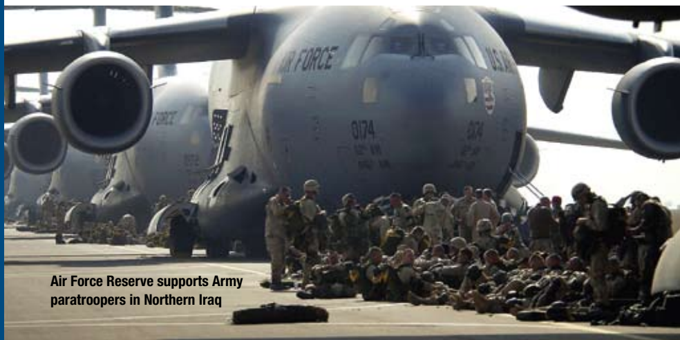
Air Force Reserve supports Army paratroopers in Northern Iraq

Again, operational force policy should begin with the recognition that the term Active duty is no longer the purview of the Regular Component; thousands of Air Force Reservists are on Active duty every day. Our