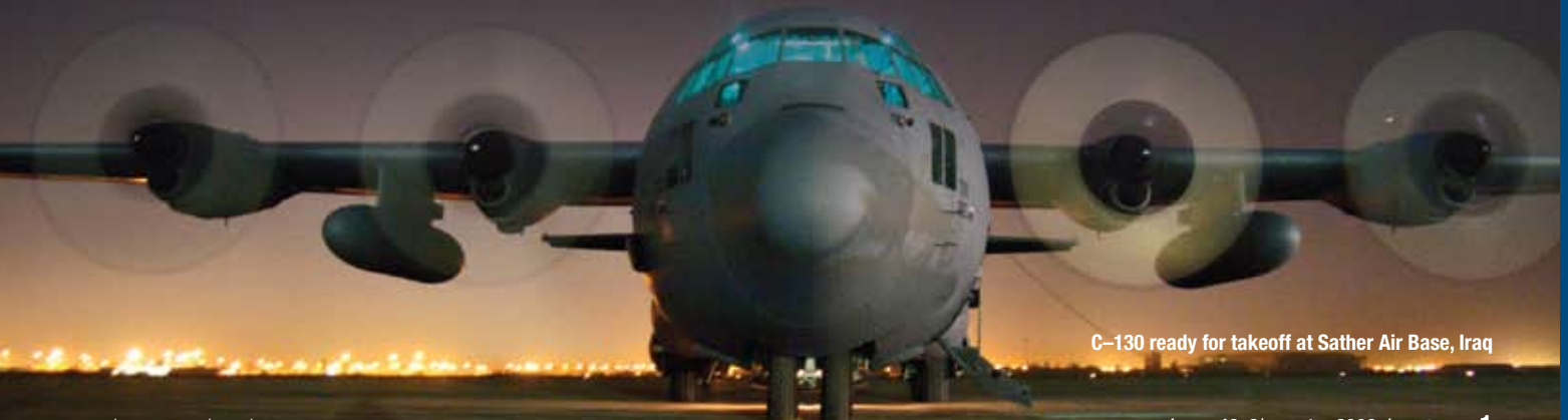
C-130 ready for takeoff at Sather Air Base, Iraq