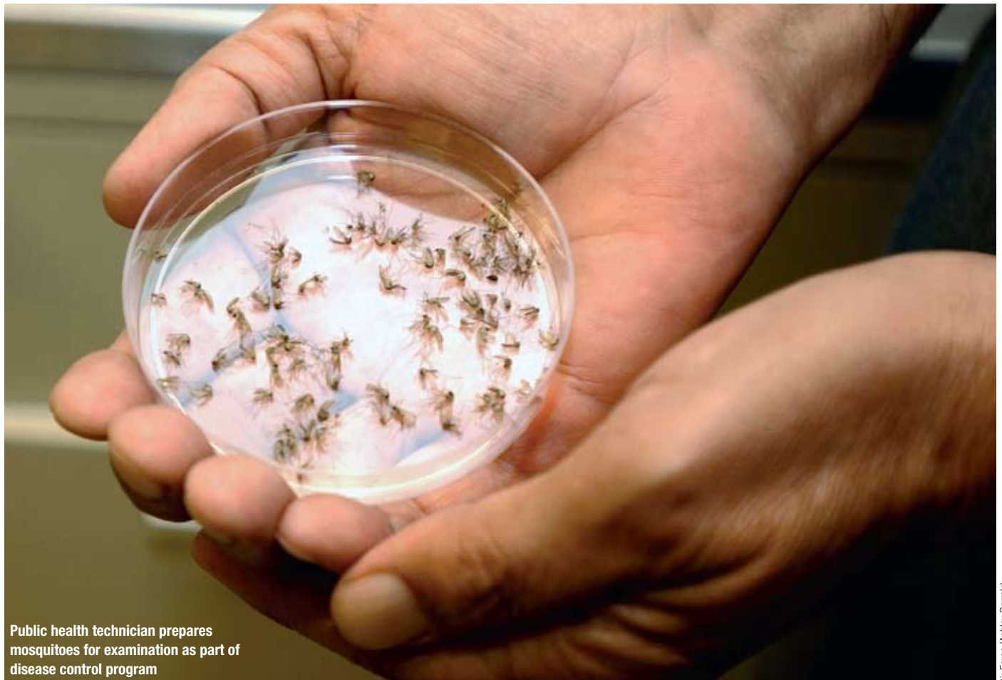
Public health technician prepares mosquitoes for examination as part of disease control program

Preparing by word and deed for the unthinkable is hardly a pleasant exercise, but if we engage in it today, we can prevent far greater harm from befalling us tomorrow. If we plan for the worst, we just might avoid some and maybe even all of it. JFQ