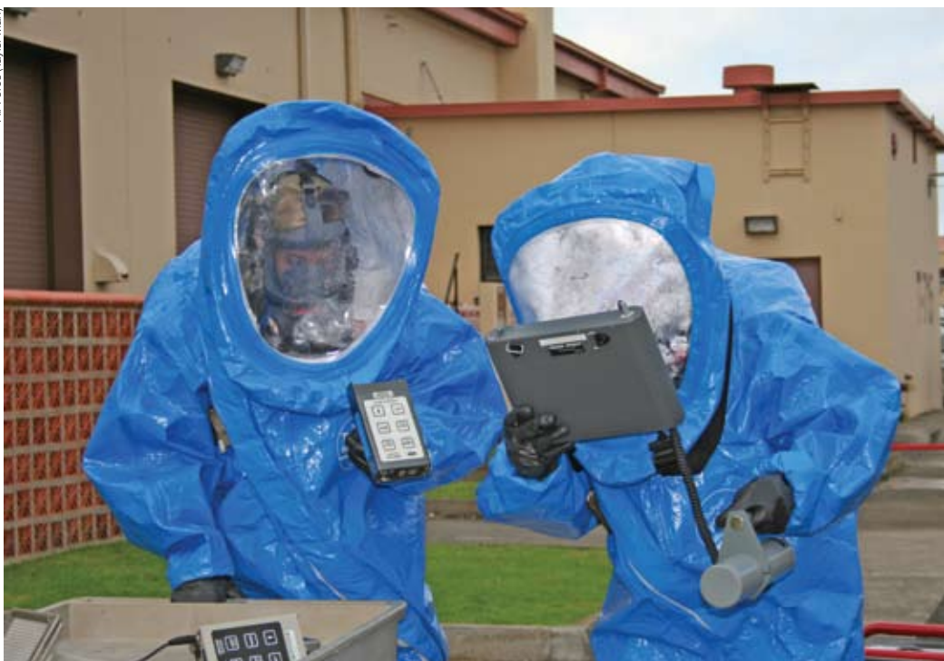
Airmen conduct biohazard readings during antiterrorism/force protection exercise