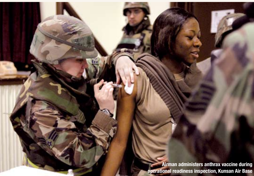
Airman administers anthrax vaccine during operational readiness inspection, Kunsan Air Base

To integrate these three types of information—clinical, detection, and non-medical intelligence information—we have a program under way to create a national biosurveillance integration center, which is now up and running and will be fully operational later this year. By fusing the clinical data, the regular intelligence information, and ultimately the BioWatch data, including next generation sensors, we can ensure that