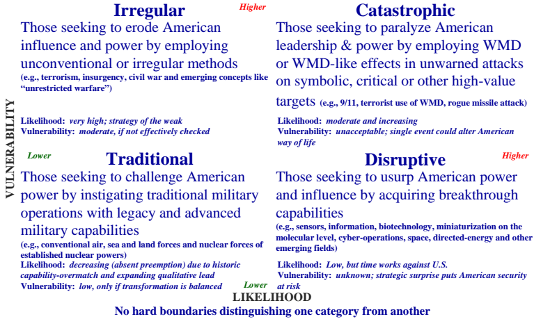
Figure 1. The "Quad Chart" Circa Spring 2004. 5