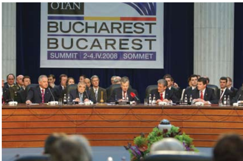
Participants at the Bucharest Summit look for ways to link to NATO missile defense