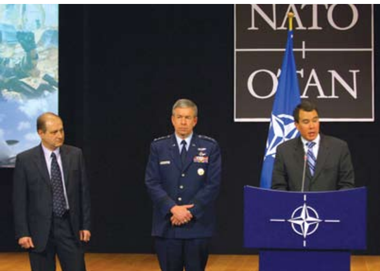
State Department and Missile Defense Agency representatives give press conference after NATO-Russia Council meeting

NATO has been examining the requirements for missile defense for several years. Its past focus has been on the protection of military forces operating outside of Europe against short-range missile threats. The United States, Germany, and the Netherlands, for example, are deploying new shorter range missile defenses composed of the PAC-3 system. Italy, Germany, and the United States are jointly developing the Medium Extended Air Defense System (MEADS) to provide a mobile defense of expeditionary forces against short-range missile threats. As ballistic missile threats have evolved