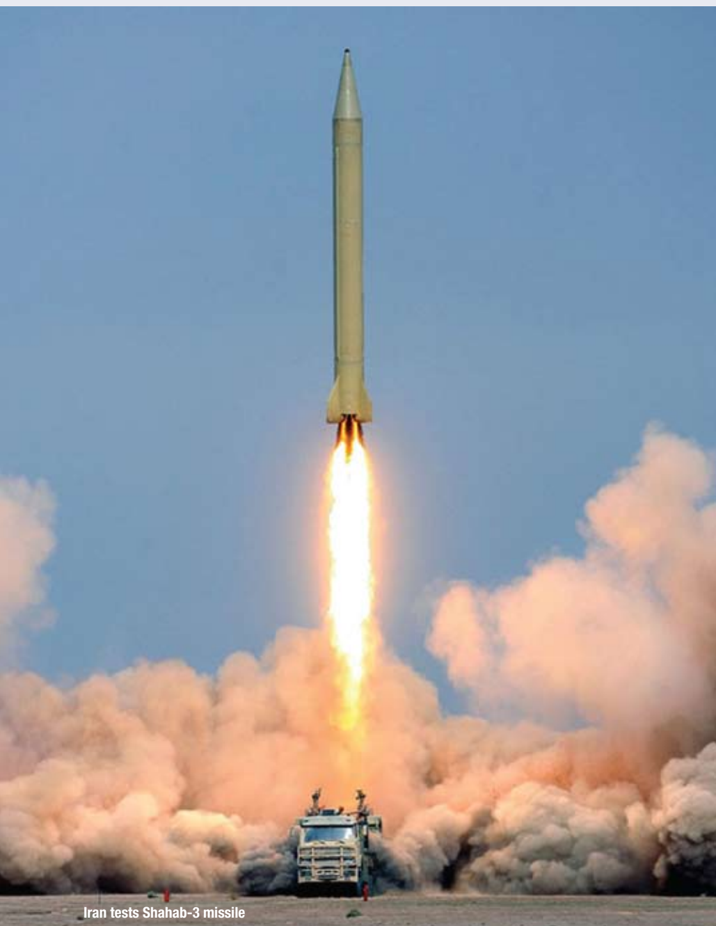
Iran tests Shahab-3 missile

A rmed with weapons of mass destruction (WMD), the global proliferation of ballistic missiles is introducing more widely the means of modern strategic warfare that were once the purview of only a small number of countries. This transformation in the security environment raises new questions for the North Atlantic Treaty Organization (NATO) on the strategic implications of defending its territory against ballistic missile attack. During the recent summit in Bucharest, Romania, the Alliance acknowledged for the first time that missile defense can make a contribution to protecting NATO territory, including its populations, from attack. Consequently, NATO is undertaking an intensive examination of the issues associated with a comprehensive continental defense against ballistic missiles to enable it to counter future military risks.