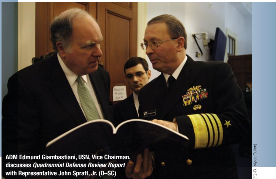
ADM Edmund Giambastiani, USN, Vice Chairman, discusses Quadrennial Defense Review Report with Representative John Spratt, Jr. (D-SC)