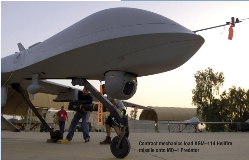
Contract mechanics load AGM-114 Hellfire missile onto MQ-1 Predator