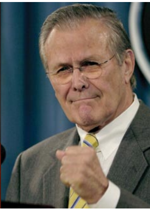
Secretary Rumsfeld speaking about war on terror