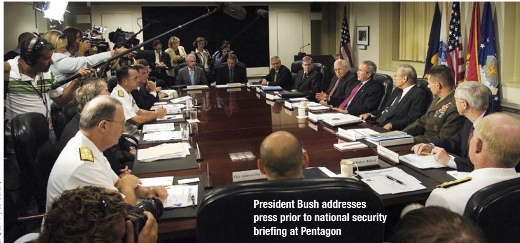
President Bush addresses press prior to national security briefing at Pentagon

A more difficult case for flexible institutions as a measure of professionalism occurs when civilian leaders are perceived as interfering in traditional military operations. For example, the Executive may want to exercise control over where and when a single aircraft launches a single missile against a single target. Civil authorities often may wish to dictate constraints on troop levels, materiel supplies, or the tempo of a military engagement. The professional military must act to create a culture, doc-