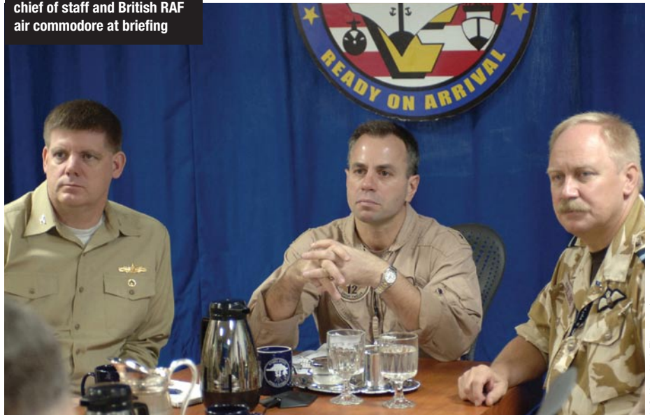
Commander of Enterprise Carrier Strike Group with his chief of staff and British RAF air commodore at briefing