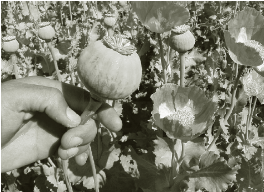
Figure 1. Opium Poppy Capsule. 11

Opium poppy is a hardy, drought-resistant plant easily grown in most parts of Afghanistan, with a growing cycle that conveniently spreads the farmer's workload throughout the year. Opium poppy is usually planted between September and December and flowers after approximately 3 months. The flower's petals then fall away, leaving the plant's seed capsule containing an opaque, milky sap known as opium (see Figure 1). Harvested between April and July, the plump seed capsules are then lanced, allowing the opium sap to ooze out for collection after it has dried into a black tar-like substance. The opium sap is then refined into opiate-based products.