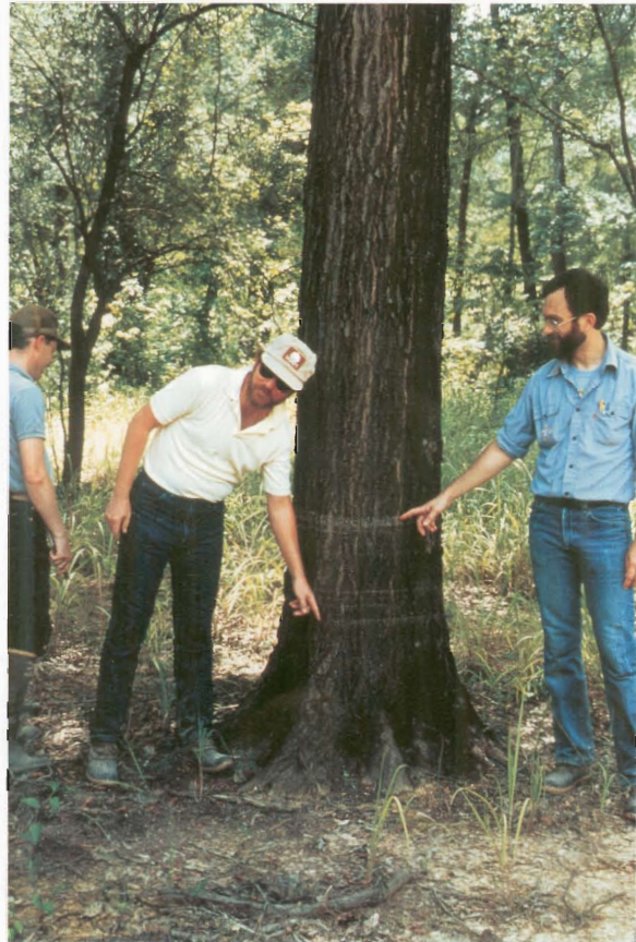
Watermark in seasonally-flooded wetland

Wetland delineators more often use hydrologic indicators that can be observed during a field inspection. For example, the following indicators provide evidence of periodic flooding or soil saturation: