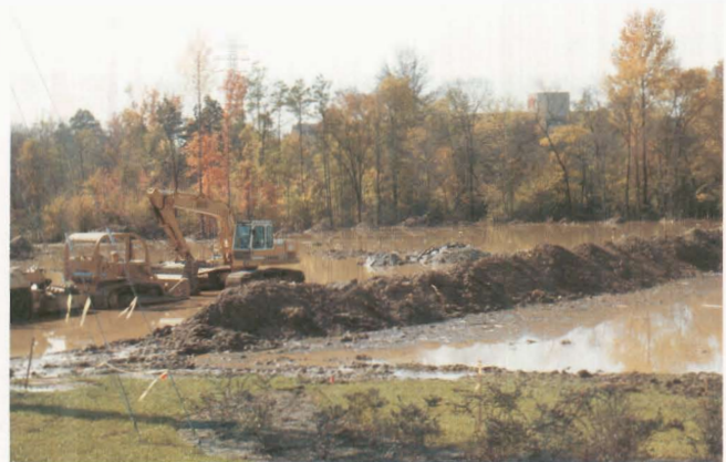
Wetland fill activity

Wetlands are known by many different names, some of which are specific to particular regions of the country. Wetlands that are dominated by trees and shrubs are commonly called swamps . Swamp forests associated with rivers and streams in the Southeast are locally known as bottomland hardwoods. Wetlands that consist of herbaceous vegetation, such as sedges, cattails, and bulrushes, are known as marshes . Marshes are highly variable and include fens, sloughs, potholes, and wet meadows. Bogs are generally dominated by sphagnum moss, which, when it dies, builds up in thick layers of peat. Extensive bogs in Canada and Alaska are called muskegs.