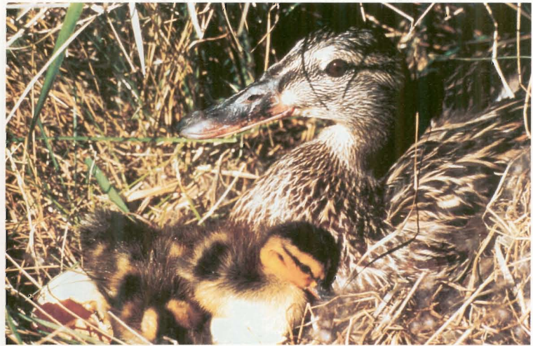
Wetlands provide habitat for wildlife