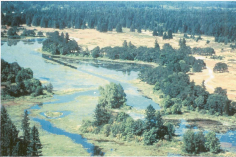
Watershed view of wetlands associated with a lake ecosystem

The information presented here will help you to determine whether you have a wetland on your property. If you intend to place fill material in a wetland or in an area that might be a wetland, contact the local District Office of the U.S. Army Corps of Engineers (Corps) for assistance in determining if a permit is required.