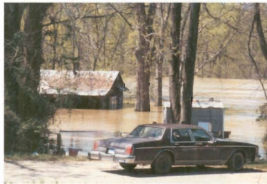
Wetlands help prevent flood damage

One of the goals of the Clean Water Act is to prevent the degradation of the Nation's waters, including needless destruction of wetlands. Wetlands benefit people in many ways that may not be obvious. Depending upon their location, wetlands provide one or more of the following benefits: