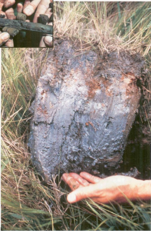
Gray color indicates wetland soil