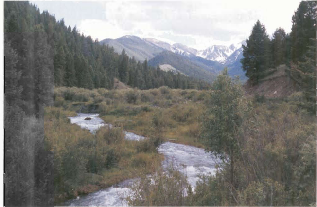
Wetlands help improve water quality

The final determination of whether an area is a wetland and whether the activity requires a permit must be made by the appropriate Corps District Office.