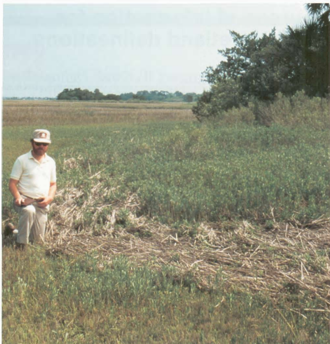
Drift line in tidal marsh