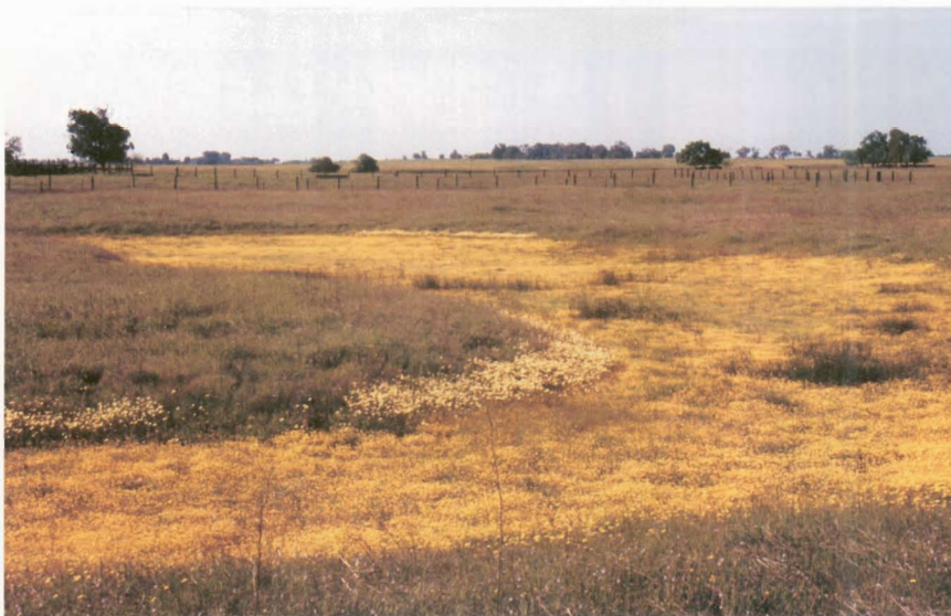
Vernal pool plant community