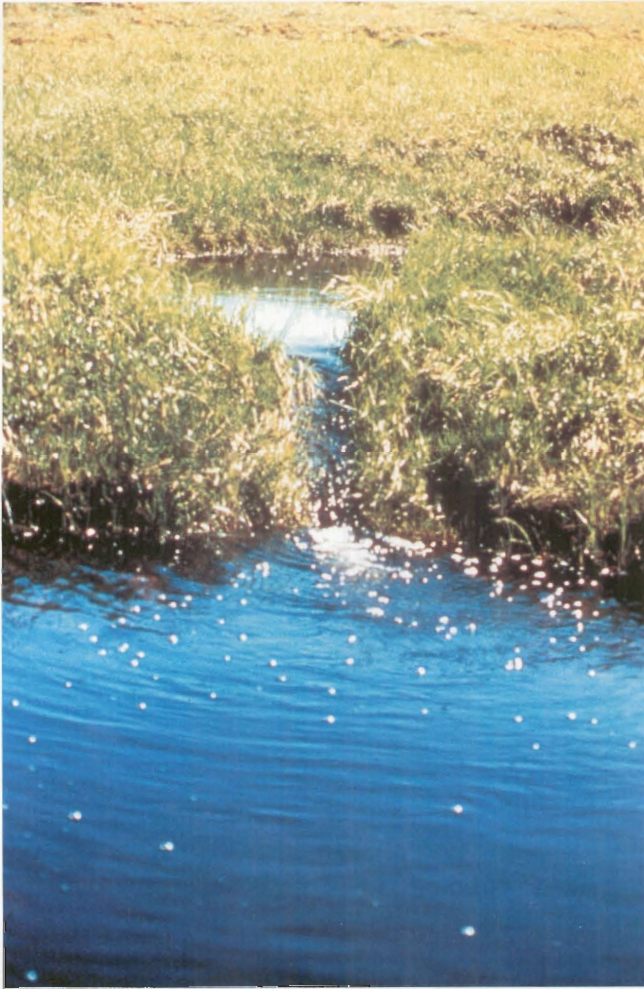
Sedimentation trap — a wetland function