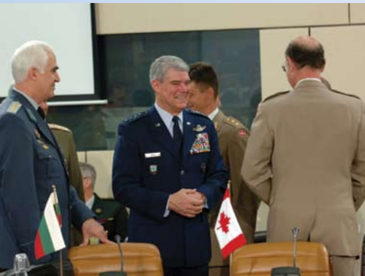
Meeting of NATO Military Committee Chiefs of Staff session