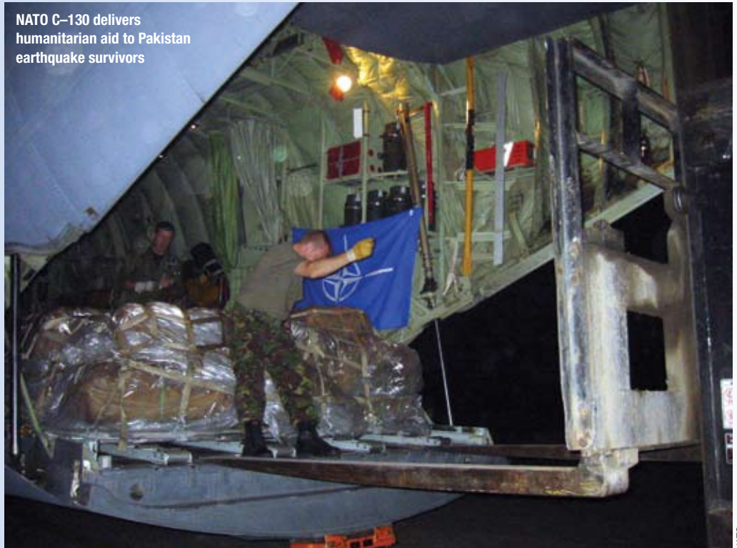
NATO C-130 delivers humanitarian aid to Pakistan earthquake survivors

A key consideration in assessing the Alliance's transformational options is the need to balance the "three-legged milk stool" of acceptable economic and political costs, environmental fit of proposed solutions, and ability to make rapid impact in the operational environment. The transformation of Allied Special Operations capability is an ideal opportunity to achieve this balance while making an appreciable and formative difference in the capabilities of the Alliance. The price in both manpower and resources will not be inconsequential. However, it is well worth the effort in bolstering our collective ability to defeat the global threats of today and tomorrow. JFQ