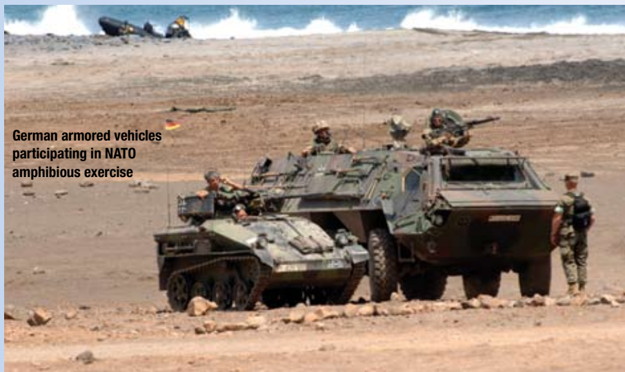
German armored vehicles participating in NATO amphibious exercise