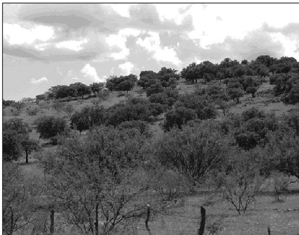
Figure 2 —Example of vegetation indicative of MLRA 41-1 in Sonora, Mexico.

Through field observation it was discovered that the western part of Sonora, like that of the Arizona/California border, is more typical of the Sonoran Desert, like that of MLRA 40, and is accordingly the western limit. The vegetation of the Chihuahuan Desert becomes more evident toward Texas, as