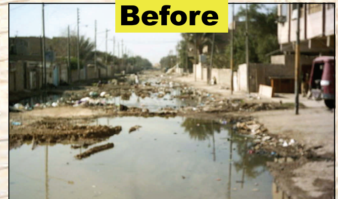
Raw sewage in the street.