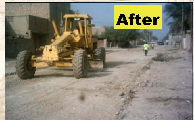
New sewer system is installed in East Baghdad.