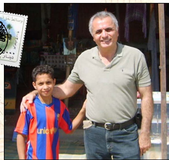
Saying hello to an Iraqi youngster at a shop in the IZ.