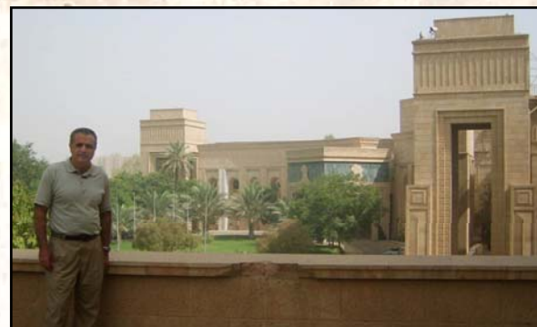
Palace in the International Zone