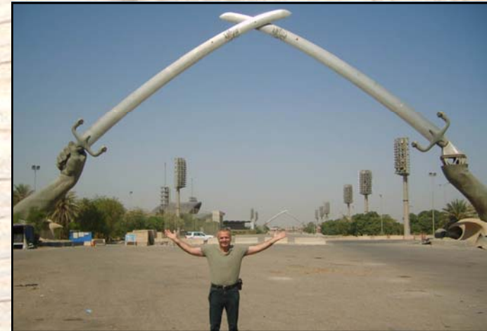
Crossed Swords made famous by Saddam.