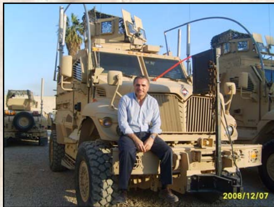
One means of transportation.