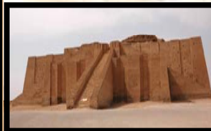
The Ziggurat of Ur

I manage a workload of 30 projects valued at approximately $57 million. I will have completed 20 projects on this tour making a total of 130 on all three tours spanning 24 months in Iraq.