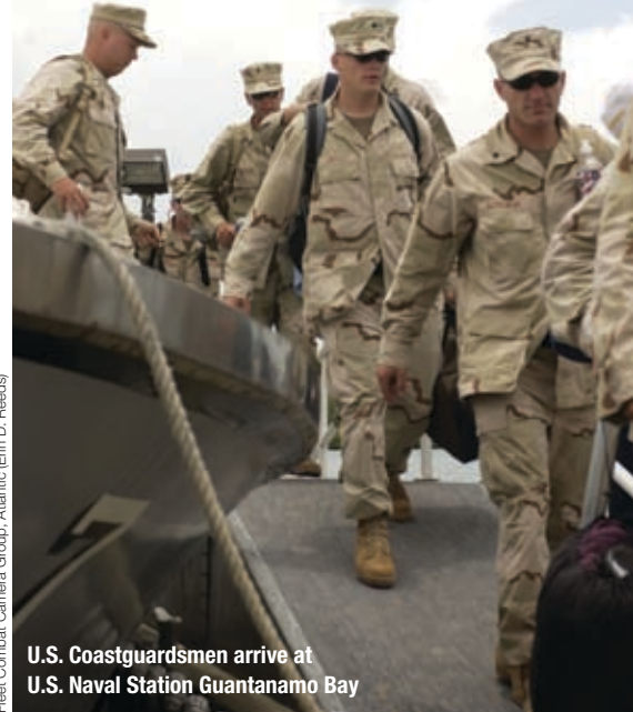
U.S. Coastguardsmen arrive at U.S. Naval Station Guantanamo Bay