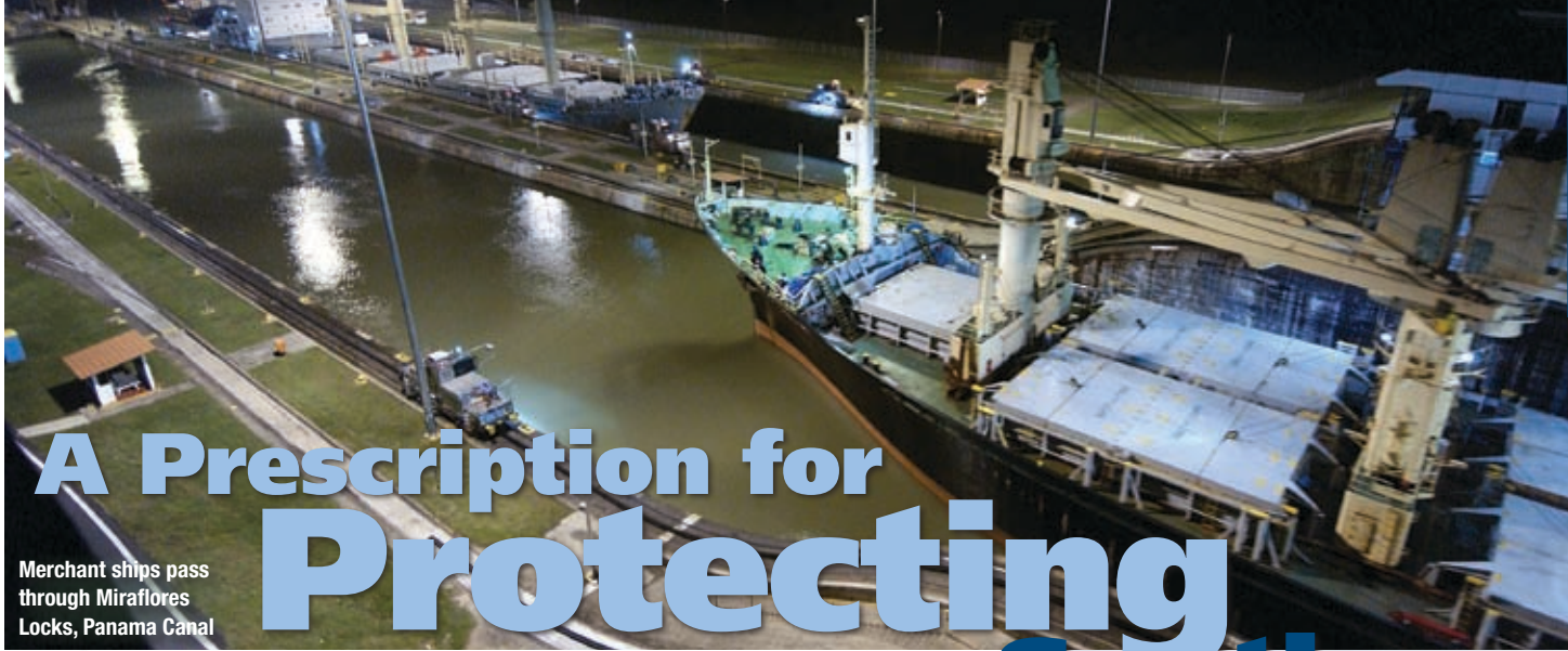
Merchant ships pass through Miraflores Locks, Panama Canal