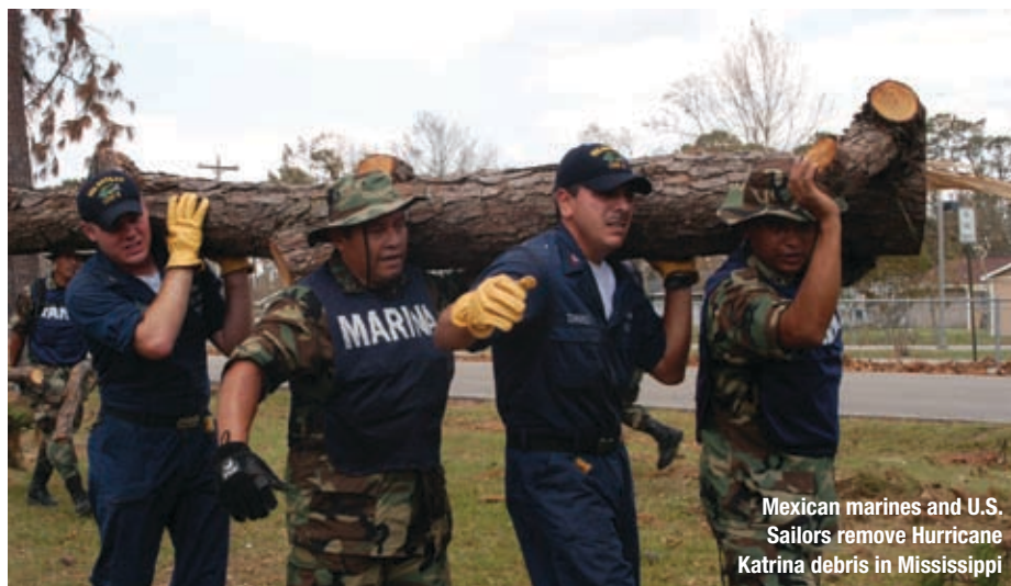
Mexican marines and U.S. Sailors remove Hurricane Katrina debris in Mississippi