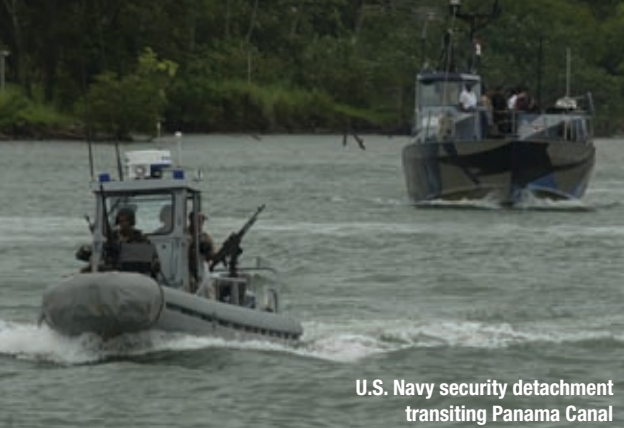
U.S. Navy security detachment transiting Panama Canal