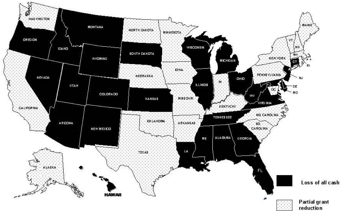
Map 12.3 Maximum Sanction for Noncompliance with Child Support Enforcement Requirements

TANF Provision: Title III of PRWORA establishes stricter child support enforcement policies. States must operate a child support enforcement program meeting general requirements in order to be eligible for TANF. Recipients must assign rights to child support and cooperate with paternity establishment efforts. States have the option to either deny cash assistance or reduce assistance by at least 25 percent to those individuals who fail to cooperate with paternity establishment or with obtaining child support. (See Map 12:3).