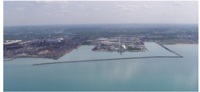
Burns International Harbor, Porter County, Indiana

Degradation of armor stone protection used in Great Lakes coastal navigation projects may occur because of a number of interacting and interrelated factors, rather than a single major cause. The need exists for a better understanding of the relationship between the standard tests used in stone specifications and the performance of stone in the structures. Research to meet this need calls for careful comparisons of stone of similar, if not identical, properties, conducted both in the laboratory and in the structures.