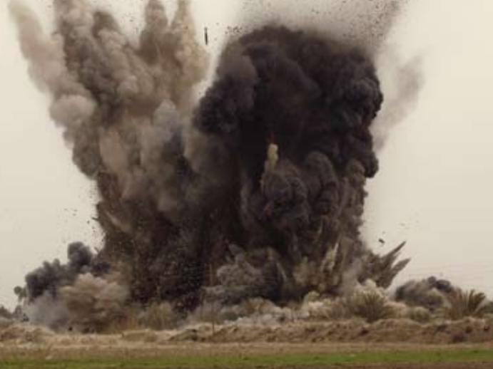
Bombs dropped by B-1B Lancer destroy insurgent torture house and prison in Northern Zambraniyah, Iraq

While still insufficient to meet the demand of the COIN environment, significantly more ISR assets are available to commanders in Iraq today than were available in the early stages of Operation Iraqi Freedom. Since 2003–2004, FMV within the corps has increased tenfold. However, it is not just about numbers; it is also about improved capability. For example, during 2003–2004, the corps/