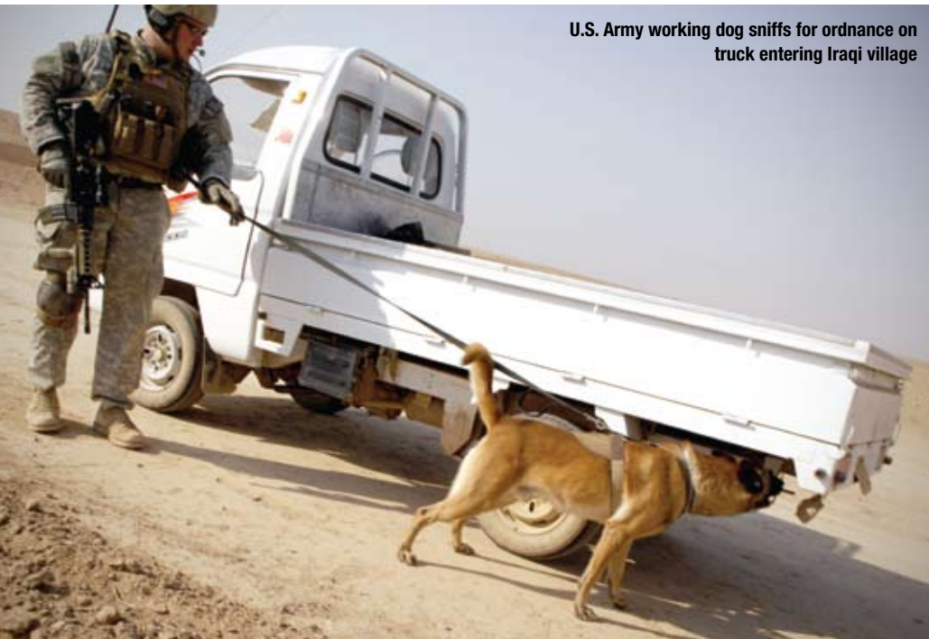
U.S. Army working dog sniffs for ordnance on truck entering Iraqi village

Decentralized control of intelligence assets, including aerial collectors regardless of Service, is a key tenet of COIN doctrine. As stated in Field Manual 3-24, Counterinsurgency , "effective COIN operations are decentralized, and higher commanders owe it to their subordinates to push as many capabilities as possible down to their level." Every BCT and RCT has a different operating environment, and only the commander knows