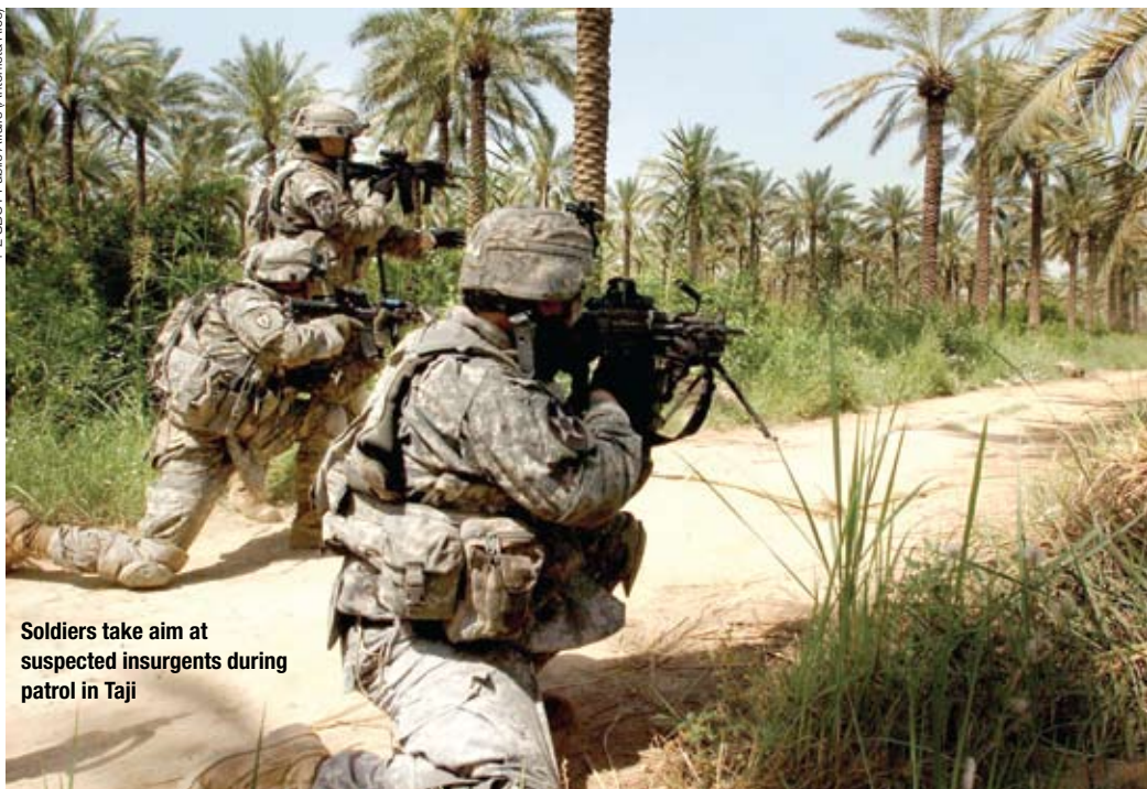
Soldiers take aim at suspected insurgents during patrol in Taji

4-2 SBCT Public Affairs (Antonietta Pico)