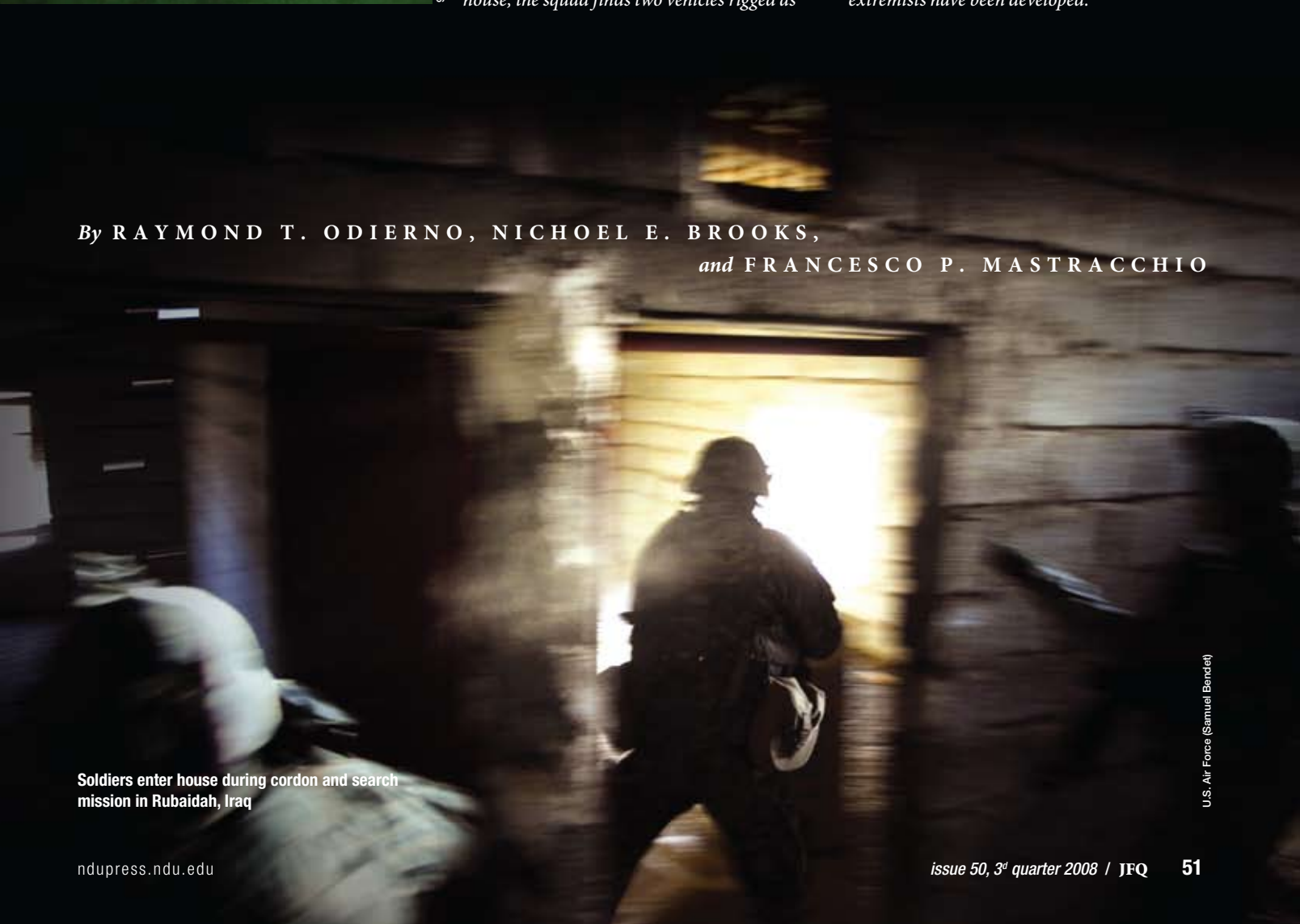
Soldiers enter house during cordon and search mission in Rubaidah, Iraq