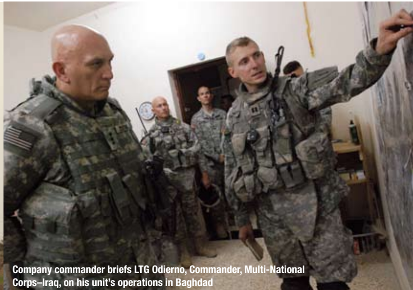
Company commander briefs LTG Odierno, Commander, Multi-National Corps-Iraq, on his unit's operations in Baghdad