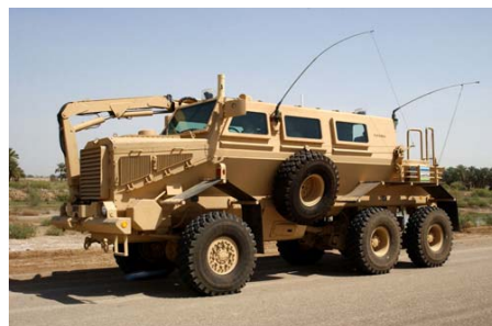
A Buffalo Stands By To Investigate a Possible Explosive in Southern Iraq

The Deputy Commander, U.S. Army Forces Command concurred with our recommendation and asked for clarification. Based on these comments, we revised our recommendation to appropriately reflect the responsibilities of the Army organizations and to clarify the actions needed. Although not required to comment, the Army, Deputy Chief of Staff, G-8, also concurred with the recommendation. We do not require any additional comments.