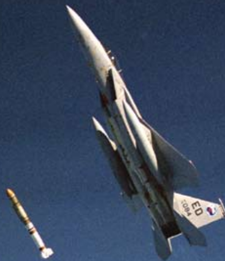
American ASAT is loaded onto F-15

of the National Reconnaissance Office that Chinese lasers have "painted" U.S. satellites indicates a capability to disrupt imaging satellites by dazzling or blinding them. 4 Jamming can disrupt U.S. military communications and global positioning system (GPS) navigation and targeting signals. The exact performance characteristics of Chinese systems are