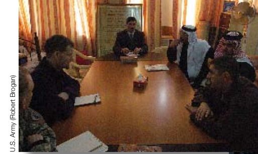
State Department representatives meet with Iraqi Ministry of Agriculture to discuss farming conditions in Salah Ad Din Province in Iraq

t is widely recognized that leaders of terrorist organizations come from the ranks of the educated and are mostly driven by extremist ideologies. The foot soldiers of terrorism, however, are often recruited from the deprived masses at the bottom of the socioeconomic and political pyramid. The leaders exploit impoverished and hopeless environments and circumstances to attract the large numbers of people needed to advance their agendas.<sup>1</sup>