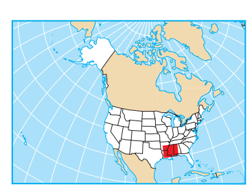
U.S. Department of the Interior U.S. Geological Survey