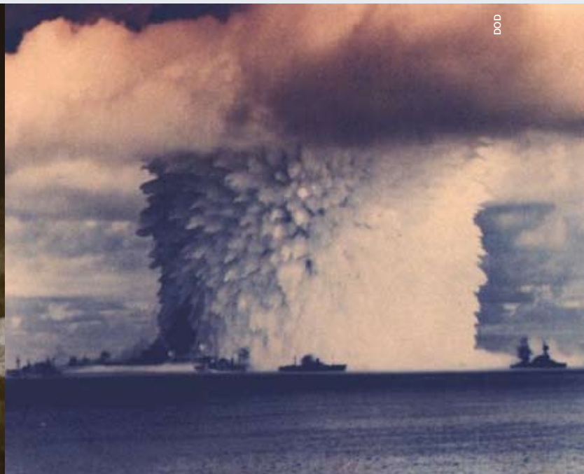
Atomic bomb test on Bikini Atoll engulfs prepositioned ships, 1946