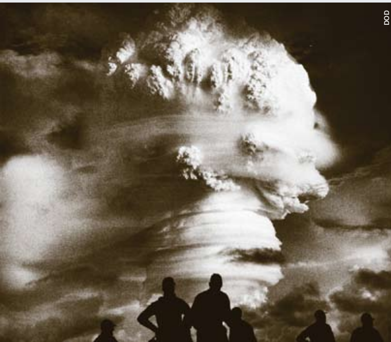
Military personnel observe atomic explosion on Bikini Atoll