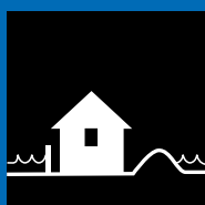
Levees and Floodwalls