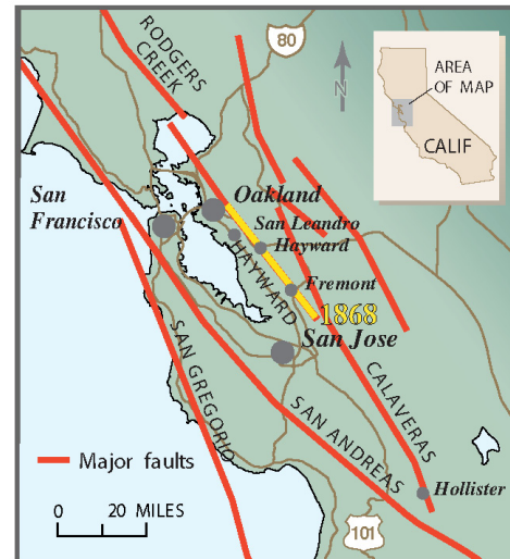
Major Bay Area faults. Yellow portion of Hayward Fault ruptured in 1868 earthquake.

Two factors make this one of the most dangerous faults in the United States. First, recent USGS research indicates that the Hayward Fault is ripe for another large earthquake. Over the past seven centuries, five strong quakes have struck the Hayward, one every 140 years on average, and 140 years have now passed since the last big Hayward earthquake occurred in 1868. Modern analysis of the observations recorded in 1868 has shown just how widespread and damaging the effects of that quake were. Second, the Hayward is the most urbanized fault in the United States. More than 2.4 million people live in Alameda and Contra Costa Counties on or near the Hayward Fault, and the entire Bay Area is home to nearly 7 million