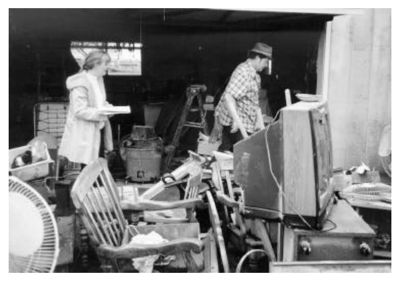
Mennonite Disaster Services volunteers assess damage after the 1996 flood in Yuba, California.

MDS assists disaster victims by providing volunteer personnel to clean up and remove debris from damaged and destroyed homes and personal property and to repair or rebuild homes. Special emphasis is placed on assisting those less able to help themselves, such as the elderly and handicapped.