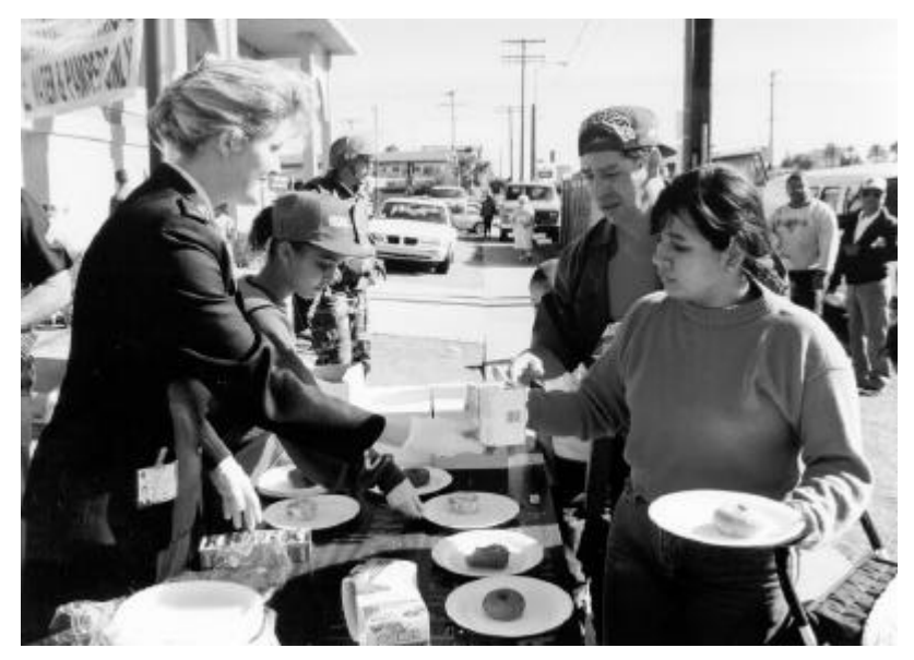
The Salvation Arny distributes food and beverages to disaster victims during the response phase following the Northridge Earthquake.

This is typically the disaster phase you see most often on television and read about in the newspapers. A disaster has occurred, or is imminent, and all available resources have been mobilized to help protect life and property. Response activities occur immediately before, during, and after an emergency or disaster. Examples include search and rescue, implementation of shelter plans, set up of first aid stations, and the distribution of food and water.