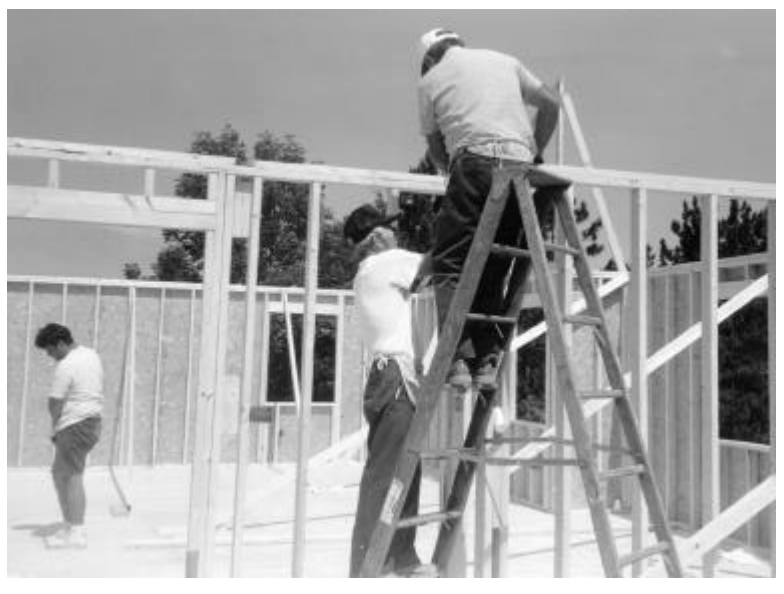
Volunteers from Friends Disaster Service work throughout the recovery phase rebuilding homes after a tornado hit Tennessee in 1995.

There are also a number of voluntary agencies that are involved in long-term recovery activities including rebuilding, clean-up, and mental health assistance. Some voluntary agencies focus solely on the long-term needs of communities, responding in weeks 6-8 of the disaster. In some cases, these agencies will continue to work on long-term activities for several years.