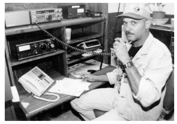
Amateur radio in action following Hurricane Marilyn.

Public service communication has been the responsibility of the Amateur Radio Service since 1913, when several radio amateurs in the Michigan/Ohio area successfully bridged the communications gap surrounding a large isolated area left by a severe windstorm in the Midwest. In those early days, such disaster work was spontaneous and without organization of any kind. ARRL was founded in 1914. Since