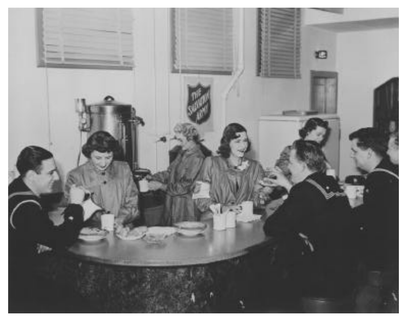
Women volunteers with the Salvation Army served doughnuts, pastries, and coffee to coastguardsmen during World War I.

When World War I was officially declared, American women again mobilized extensive support systems. The National Woman's Committee quickly formed state organizations, which in turn developed local committees of volunteers in every county and city. In this war, some women even went abroad with the troops for the first time. Women volunteers from the Salvation Army served as chaplains and "Doughnut Girls" during World War I. The war brought unprecedented cooperative action between voluntary organizations. The YMCA,