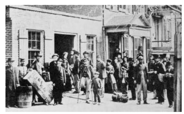
The U.S. Christian Commission headquarters in Washington, D.C., "served hot coffee, prayers, and general good cheer" to Union soldiers.

The need for arms and ammunition was met by private volunteer efforts during the war. Huge amounts of money were raised, often from donated jewelry, to buy and construct gunboats and other necessary fortifications. In addition, charitable organizations in the North and South provided food, drinks, and spiritual comfort to the soldiers of the Civil War.