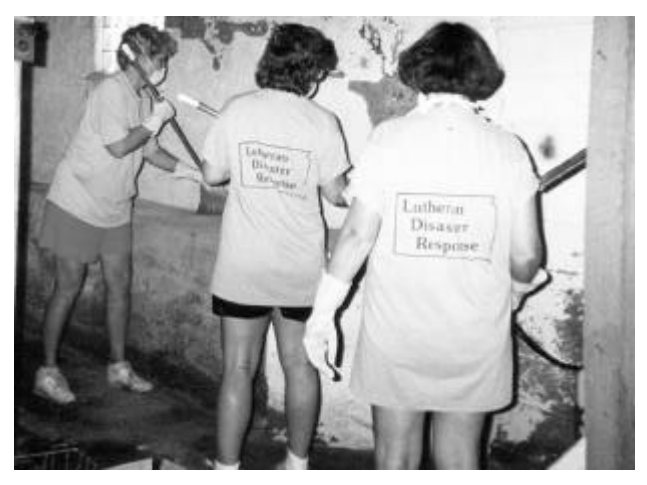
Lutheran Disaster Response volunteers provide clean-up services following a major flood.

LDR provides for immediate disaster response, in both natural and technological disasters, long-term rebuilding efforts, and support for preparedness planning through synods, districts, and social ministry organizations. The disasters to which LDR responds are those in which needs outstrip available local resources. LDR provides for the coordination of 6,000 volunteers annually. In addition, LDR provides crisis counseling, support groups, mental health assistance, and pastoral care through its accredited social service agencies.