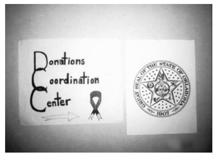
The Oklahoma State Donations Coordination Center provided much needed space for voluntary agencies to meet with their State and local counterparts to discuss donations coordination issues throughout the intensive response period following the Oklahoma City Bombing. Some 5,000 calls were taken by the State-FEMA donations phone bank alone.