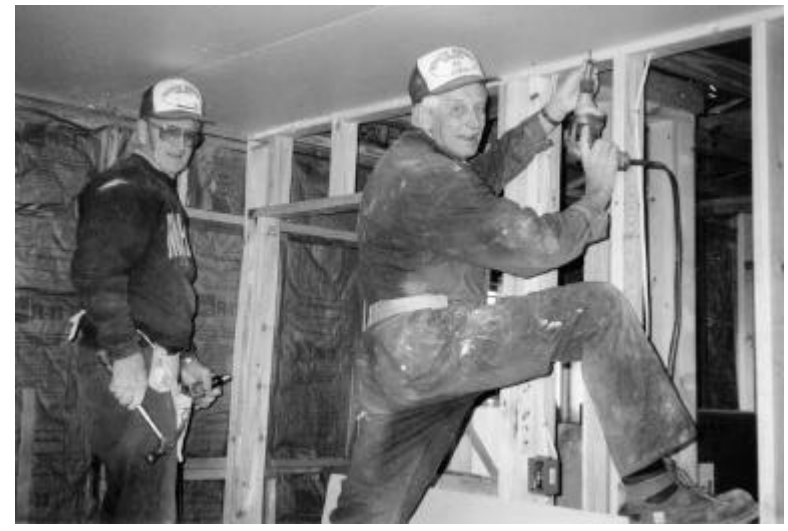
Local volunteers from the Christian Reformed World Relief Committee provide rebuilding services in Fort Smith, Arizona.

Most voluntary agencies work closely with the populations they end up assisting in times of disaster. Voluntary agencies are well grounded in the communities they