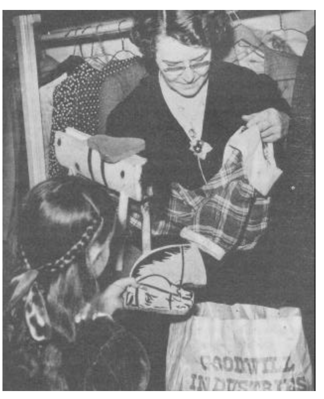
The Depression elicited many charitable responses, including collections of used clothing and goods from almost every family able to give.

Upon American entry into World War II, the American Red Cross recruited more than 71,000 registered nurses for military duty. The American people further supported the Red Cross through contributions of nearly $785 million. During World War II, Adventist Community Services established warehouses in New York and San Francisco to process materials to ship overseas to Europe,