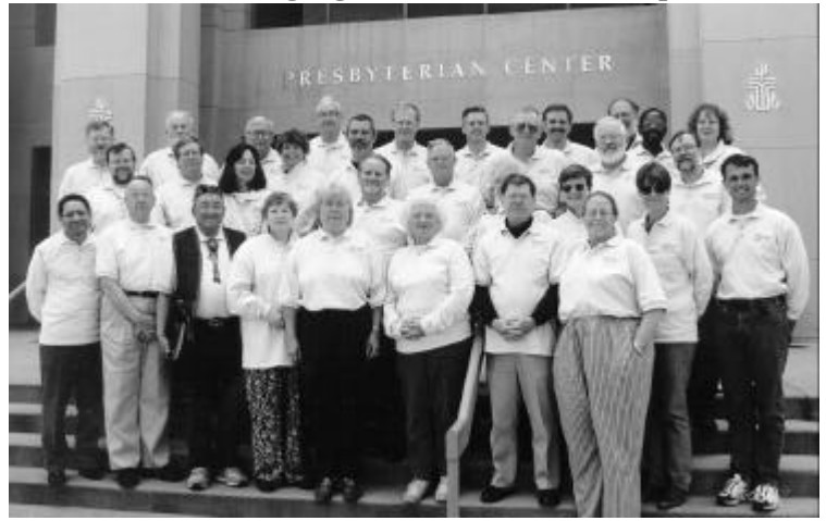
witness the healing love of Christ through caring for communities adversely affected by crises and catastrophic events. Presbyterian Disaster Assistance is one of the three programs supported by the One Great Hour of Sharing offering. It is part of the World Wide Ministries Division of the Presbyterian Church (USA) and is administered under the direction

PDA enables congregations and mission partners of the Presbyterian Church (USA) to