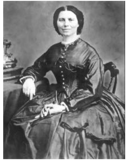
Clara Barton, Founder of the American <u>Red Cross. (Used with the permission</u> of the American Red CroRage 2-19

"to continue and carry on a system of national and international relief in time of peace and apply the same in mitigating the sufferings caused by pestilence, famine, fire, floods, and other great national calamities, and to devise