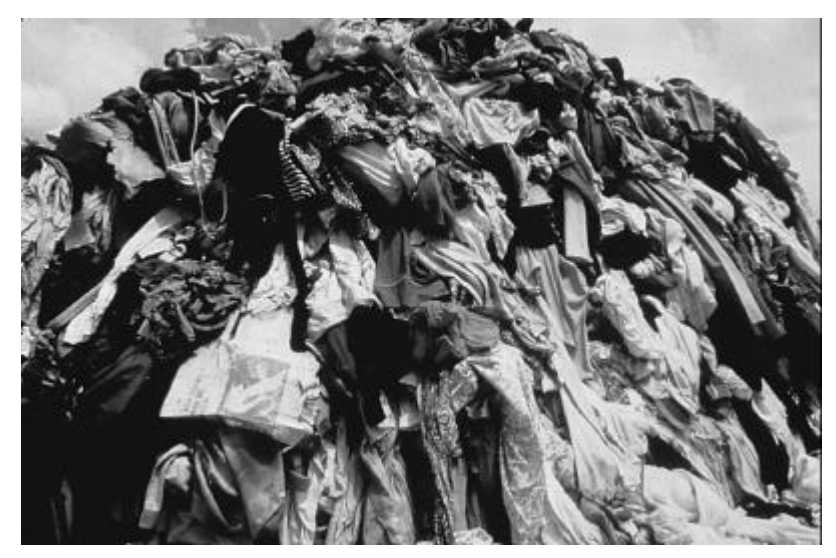
This is an example of the enormous waste of donated clothing after Hurricane Andrew. Poor donations management planning can lead to horrendous logistics and public relations problems. Ultimately, it results in poor service to both the donors and the community in need.

Voluntary agencies set up shelters for evacuees. It quickly became evident that the sheltering requirements for tens of thousands of residents was beyond the capacity of the voluntary agencies. For the first time, voluntary agencies and the military worked together to provide temporary "life support centers" to accommodate large numbers of people. The problem of unsolicited goods also required significant military support in the receiving, storing, transporting and distributing of these goods. This lack of donations management planning on the part of