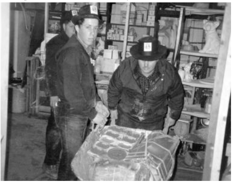
Volunteers from Mennonite Disaster Services provide clean-up services after flooding in Pennsylvania.

committee mobilized at least once a year to help in major disasters in Kansas, Oklahoma, and Nebraska. In 1993, MDS was incorporated as a non-profit organization separate from the Mennonite Central Committee. Today, MDS is organized into four regions in the U.S. and one in Canada. Within the five regions, there are 40 local MDS units. These units have the primary responsibility to represent MDS in a disaster response within their own