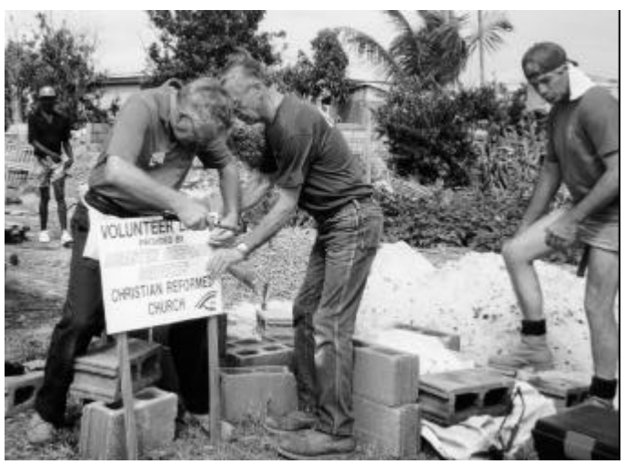
Volunteers from Christian Reformed World Relief Committee provide clean-up and rebuilding assistance in St. Croix following Hurricane Marilyn.

During Hurricane Marilyn, there was a unique level of government/ voluntary agency coordination. For example, two weeks into the disaster, Adventist Community Services took over the coordination of warehousing and the distribution of some Federal relief supplies. Mennonite Disaster Services, Church of the Brethren, and Christian Reformed World Relief Committee began tent platform building and installation on disaster victims' properties to reduce the shelter populations. FEMA supported this effort by providing ground transportation, building supplies, and equipment. For example, FEMA provided air transportation for the leaders of