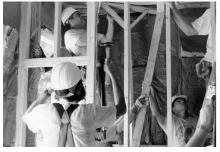
Volunteers from Presbyterian Disaster Assistance rebuild a church in Boligee, Alabama, that was destroyed by arson.

PDA works primarily through Church World Service in providing volunteers to serve as disaster consultants and funding for local recovery projects that meet certain guidelines. This agency also provides trained volunteers who participate in the Cooperative Disaster Child Care program. On a local level, many Presbyterians provide volunteer labor and material assistance.