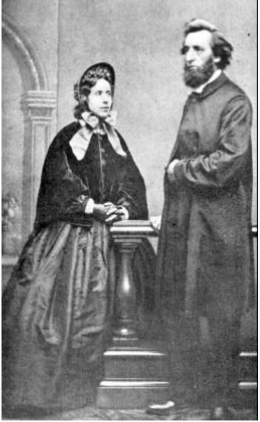
Catherine and William Booth, founders of the Salvation Army.

The Salvation Army has been providing disaster relief assistance since 1900. On September 8, 1900, when Galveston Hurricane occurred, the Salvation Army sent