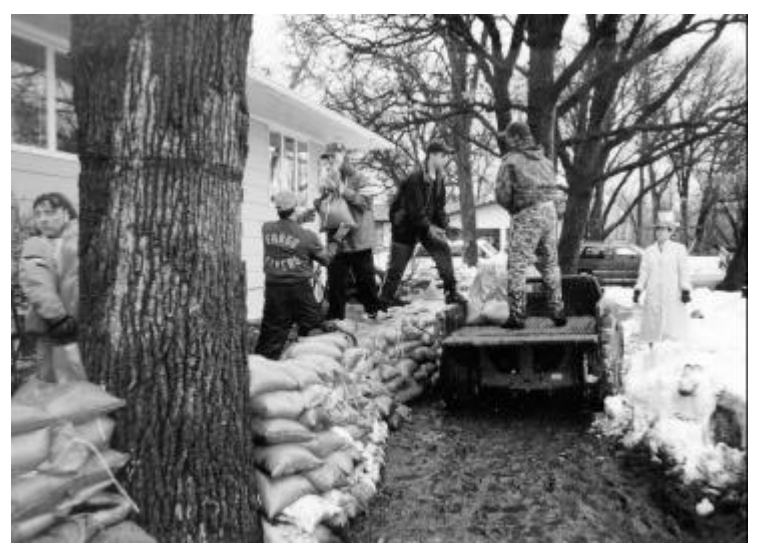
Volunteers built dikes around many homes in South Fargo, North Dakota, following the Red River Floods.

In early March 1997, flooding began in southern Minnesota and quickly spread to South Dakota and North Dakota. The greatest devastation occurred in Grand Forks, North Dakota, and East Grand Forks, Minnesota, following the failure of the dike system, which required over 50,000 people to evacuate their homes. Many small rural communities throughout the southern and central part of Minnesota and eastern North Dakota were also affected by the flooding.