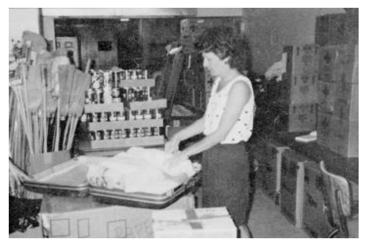
A volunteer at a Salvation Army center in Hardin, Missouri, unloads health kits from Church World Service Disaster Response. In the background you can see comfort kits and cleaning supplies that were donated from the American Red Cross.