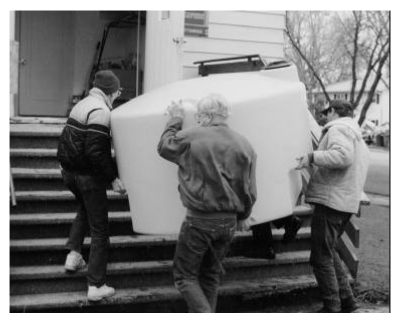
Nazarene Disaster Response volunteers assist with clean up, restoration, and rebuilding in a Virginia flood.

NDR is a national network of volunteers who respond to victims of natural and manmade disasters. NDR is a part of Nazarene Compassionate Ministries, which started in 1991 as a charitable organization, chartered and sponsored by the Church of the Nazarene. The need for an organized disaster response team representing the Church of the Nazarene became apparent during major disasters in recent years. In January 1994, a group of leaders met in