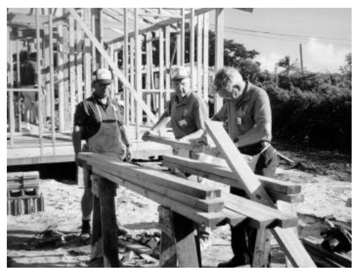
Volunteers from Christian Reformed World Relief Committee help with rebuilding efforts in Antigua in 1996.

CRWRC's Disaster Response Services has the overall aim of assisting churches in the disasteraffected community to respond to the needs of persons within that community. CRWRC provides advocacy services to assist disaster victims in finding permanent, long-term solutions to their disaster-related problems, as well as housing repair and construction, needs assessment, clean-up, child care, and other recovery services.