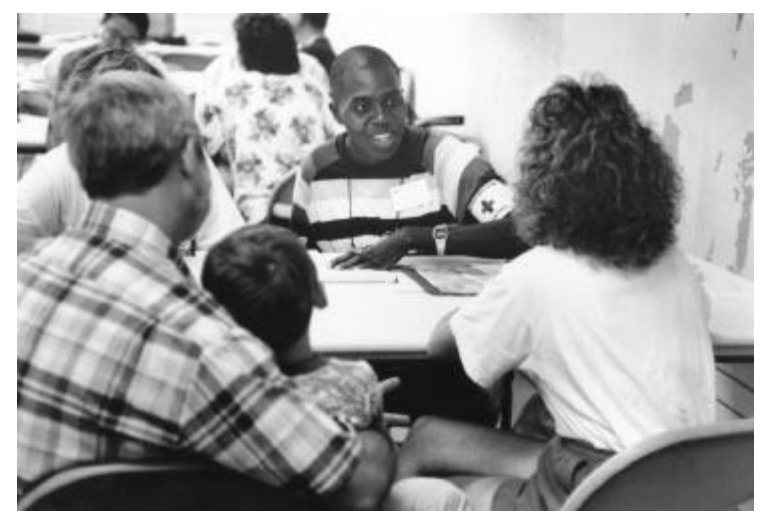
An American Red Cross volunteer assists a disaster-affected family following Hurricane Hugo. (Used with the permission of the American Red Cross.)

relief activities to ease the suffering caused by a disaster. Emergency assistance includes fixed/mobile feeding stations, shelter, cleaning supplies, comfort kits, first aid, blood and blood products, food, clothing, emergency transportation, rent, home repairs, household items, and medical supplies. Additional assistance for long-term recovery may be provided when other relief assistance and/or personal resources are not adequate to meet disaster-caused needs. The American Red Cross provides referrals to the government and other agencies providing disaster assistance.