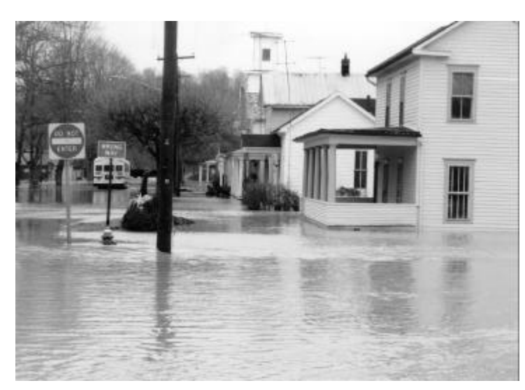
Streets were flooded for weeks in Vinton, Ohio during the Midwest Floods.

The torrential rains that hit the Midwest in June and July of 1993 defied the efforts of volunteers who placed sandbags in front of the relentless waters. During the floods, more than 14,500 people took refuge in shelters set up by voluntary agencies. In all,