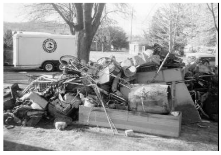
Friends Disaster Service help clean up flood debris after a 1996 winter flood in Williamsport, PA.

FDS was organized in 1974 in response to the increasing number of disasters in the U.S. FDS draws its volunteer work force from pre-registered and organized units from Friends Churches throughout the Midwest, Southern, and Eastern U.S. FDS has 15 trailers stationed across its working area. These trailers are stocked with tools and equipment pertinent to disaster response and rebuilding. FDS derives its financial support from an annual auction and