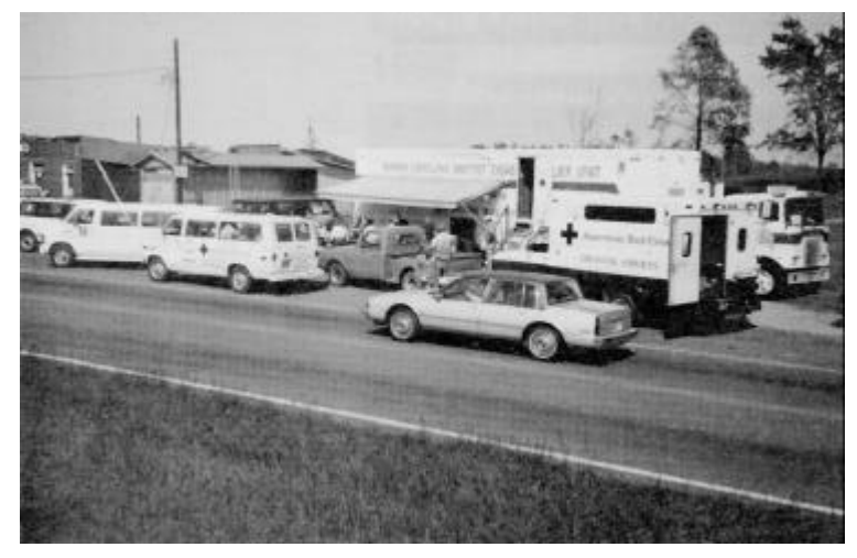
After a tornado hit Cooksville, North Carolina, in the Spring of 1989, cooperation was the key to successful disaster response. The Salvation Army van and two American Red Cross vans were stocked by the Baptist mobile kitchen. The communication unit provided by the American Radio Relay League kept it all flowing smoothly.

Effective voluntary agency collaboration benefits both the providers and the recipients of disaster assistance by allowing services to be provided in the most effective manner possible while reducing duplication of benefits between the responding agencies. When collaboration is working well, expertise and resources are shared between voluntary agencies, the government, and private businesses. This collaboration among disaster relief organizations increases creativity. responsiveness, and the ability to draw on varied resources in order to assist individuals and families in their recovery from the disaster.