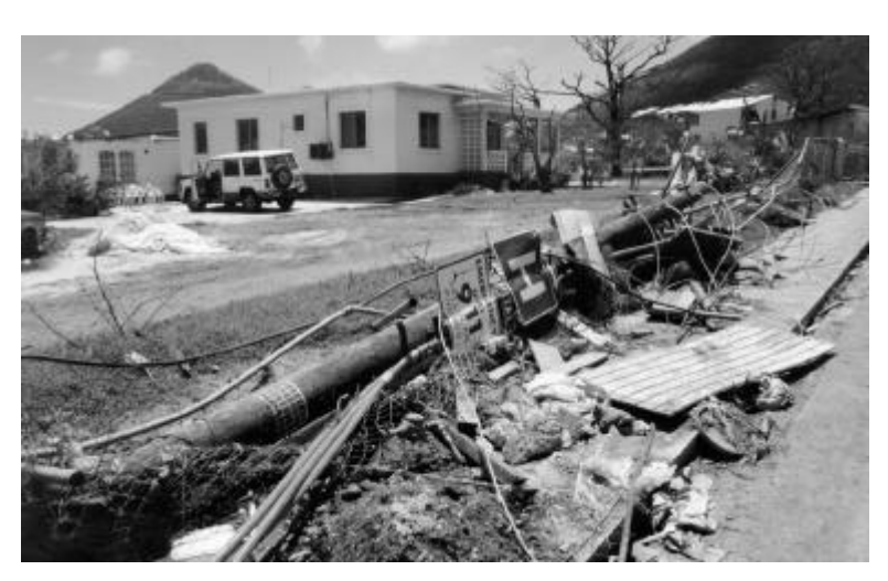
The American Radio Relay League responds when communication lines are damaged or destroyed during disaters.

ARRL is a national volunteer organization of licensed radio amateurs in the United States. ARRL-sponsored Amateur Radio Emergency Services (ARES) provide volunteer radio communications services to Federal, State, County, and local governments, as well as to voluntary agencies. Members volunteer not only their services but also their privately owned radio communications equipment.