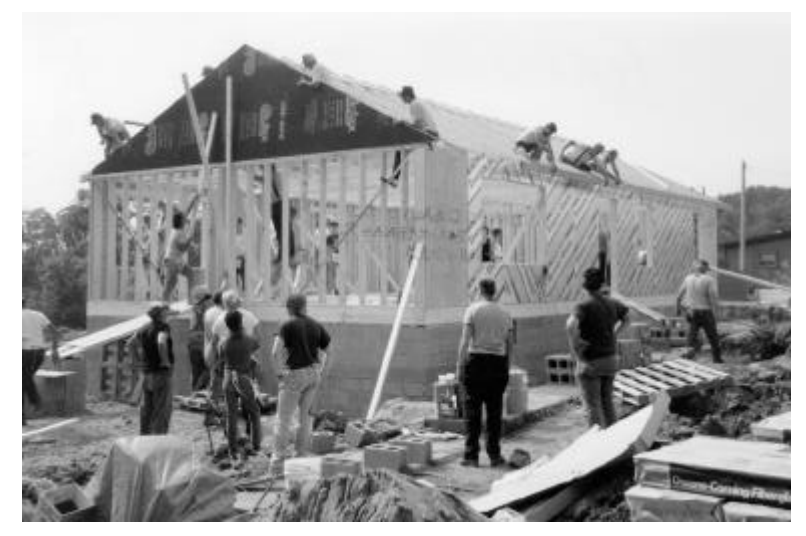
Friends Disaster Service volunteers rebuild homes in Shadyside, Ohio, in 1990.

FDS provides clean-up and rebuilding assistance to the elderly, disabled, low income, or uninsured survivors of disasters. It also provides an outlet for Christian service to Friends' volunteers, with an emphasis on love and caring. In most cases, FDS is unable to provide building materials and, therefore, looks to other NVOAD member agencies for these materials.