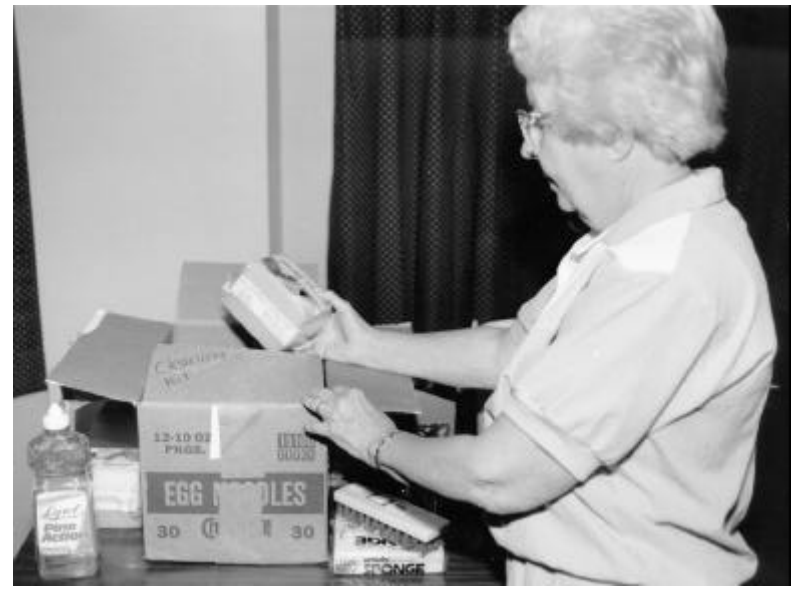
The Church World Service Disaster Response program provides cleanup services following disasters with kits containing soaps, sponges, brushes, etc.

CWS Disaster Response assists disaster survivors through inter-religious partner organizations in the U.S. and worldwide on behalf of its 32 member communions plus affiliated agencies. CWS Disaster Response is comprised of consultants who help convene local churches and religious organizations to form an interfaith organization to coordinate responses to unmet needs during the recovery phase.