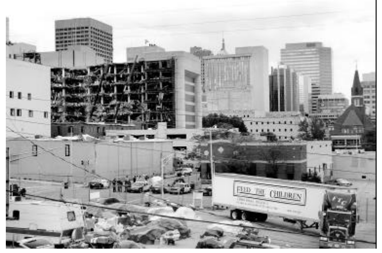
The Murrah Federal Building in Oklahoma City after a massive bomb inside a rental truck exploded in front of the building.

at day care at the Murrah Federal Office Building in Oklahoma City, the unthinkable happened. A massive bomb inside a rental truck exploded, blowing half of the nine-story building into oblivion. A stunned nation watched for nearly two weeks as the bodies of men, women, and children were pulled from the rubble. When the smoke cleared and the exhausted rescue workers packed up and left, 168 people were dead in the worst terrorist