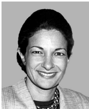
Sen. Olympia J. Snowe of Auburn Republican—Jan. 3, 1995