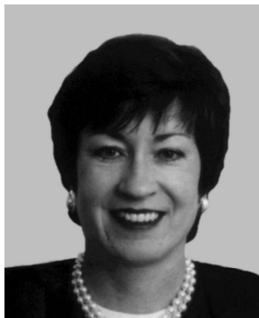
Sen. Susan M. Collins of Bangor Republican—Jan. 7, 1997